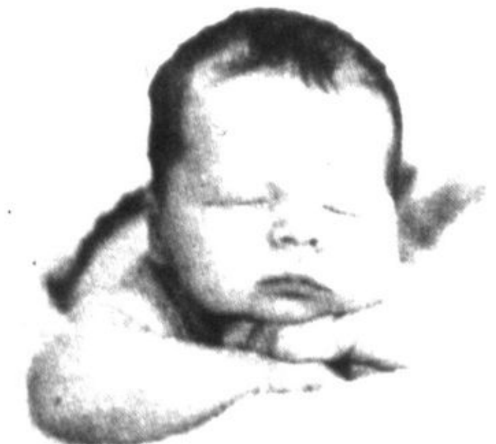
Hudson Swallow Son of Preston & Leanne Born September 14, 2014