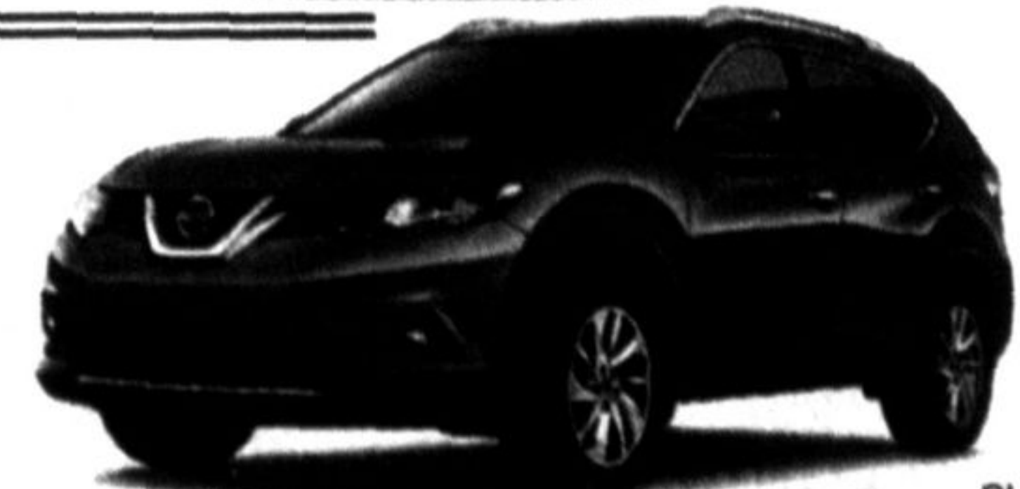
SL AWD Premium model Shown with Accessory Roof Rail Crossbars ▲