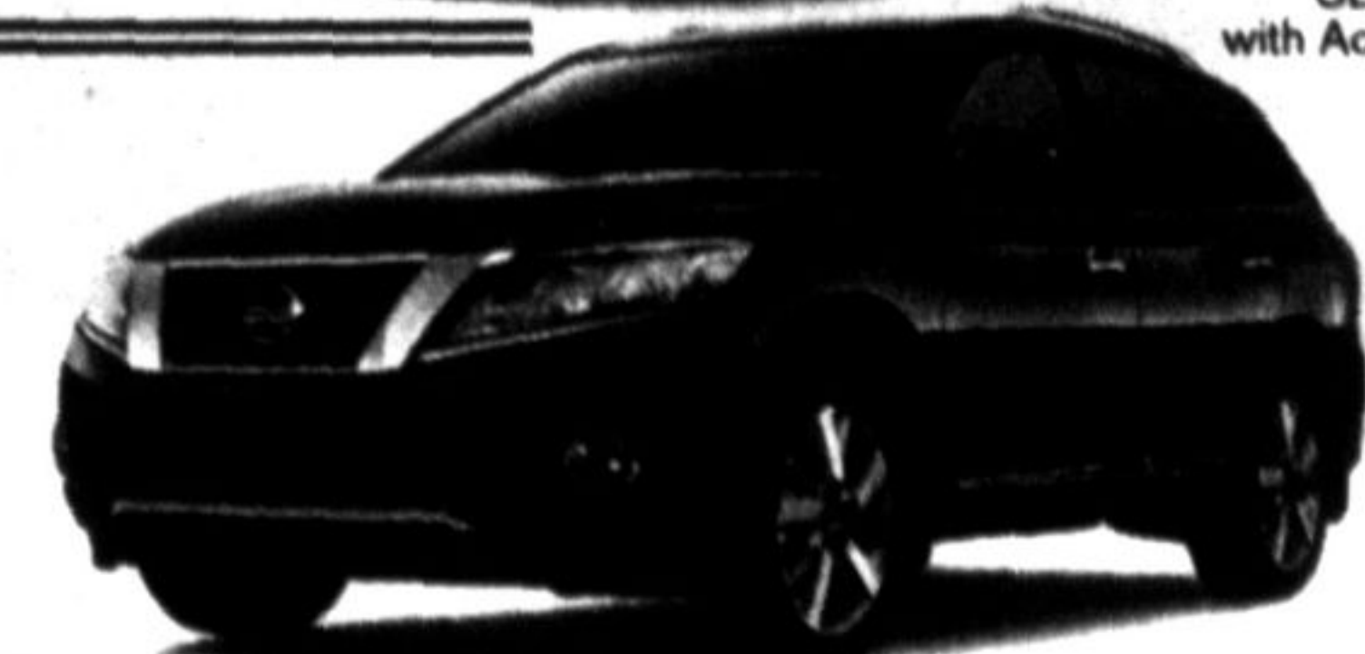
Platinum model Shown ▲