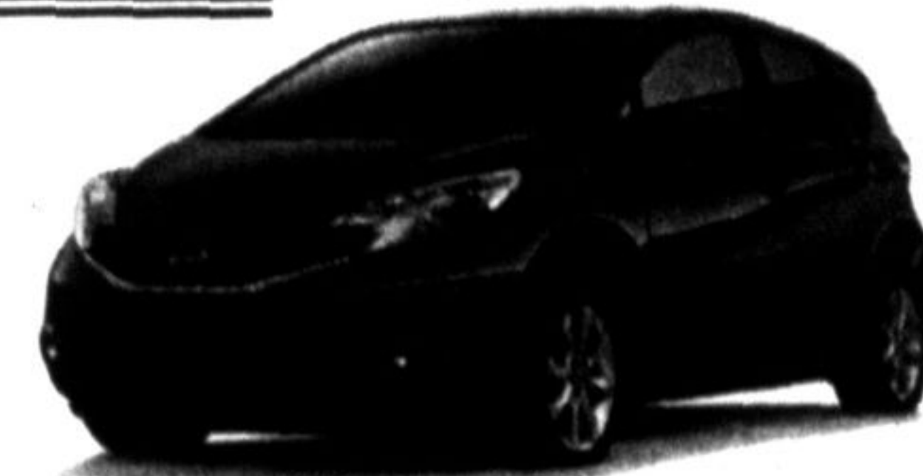
1.6 SL Tech model Shown ▲