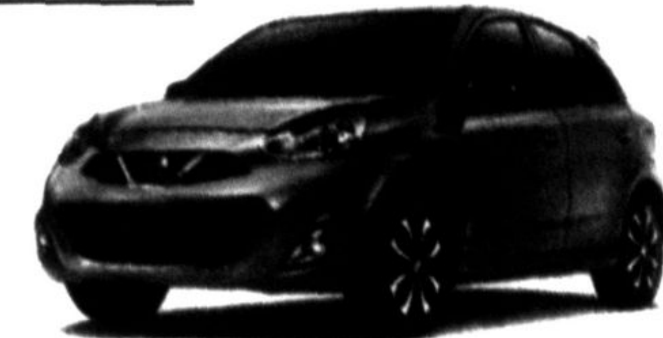
SR AT model Shown ▲