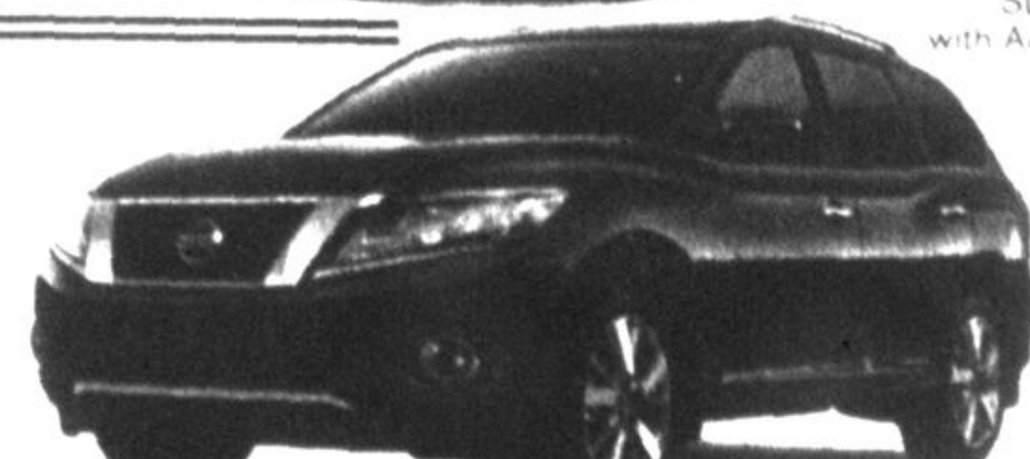
Pathfinder model Shown*