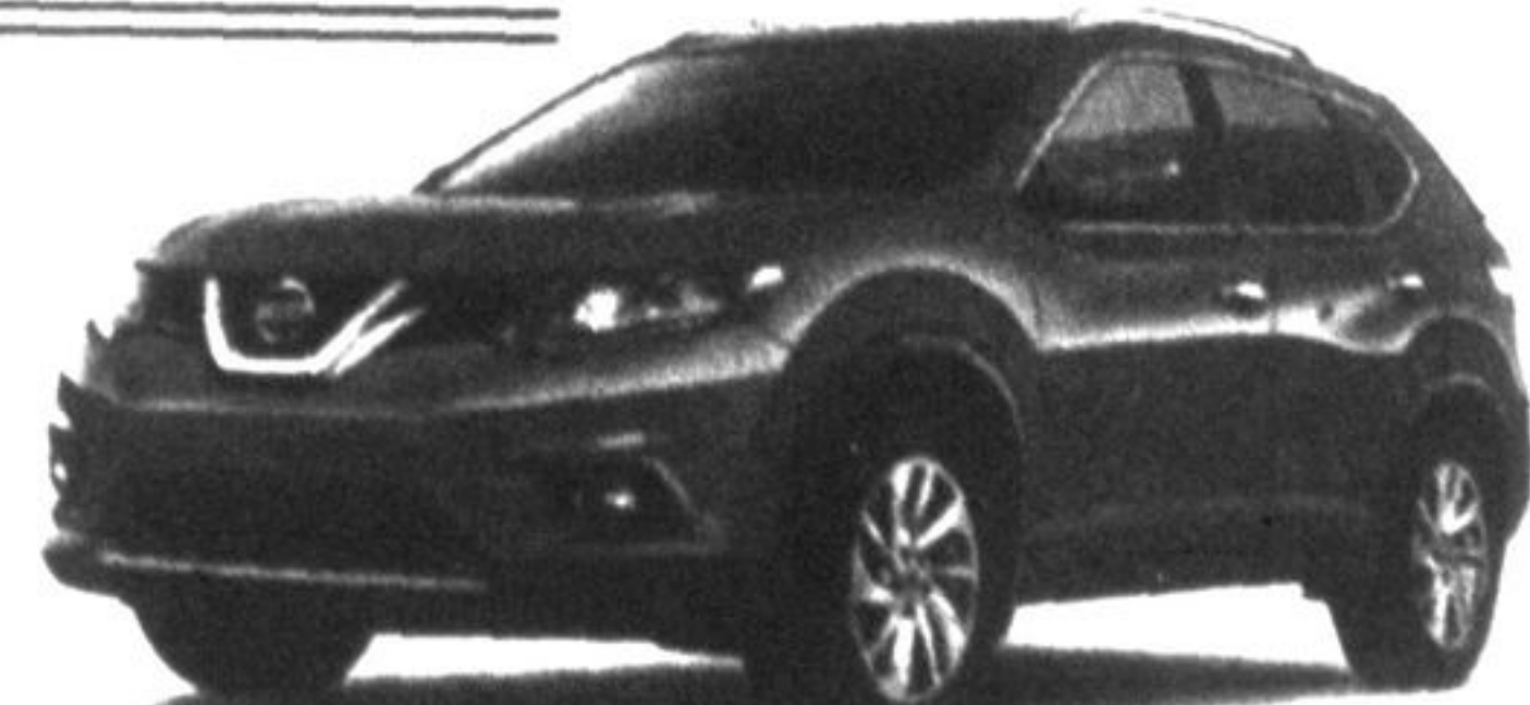
SL AWD Premium model Shown with Accessory Roof Rail Crossbars*