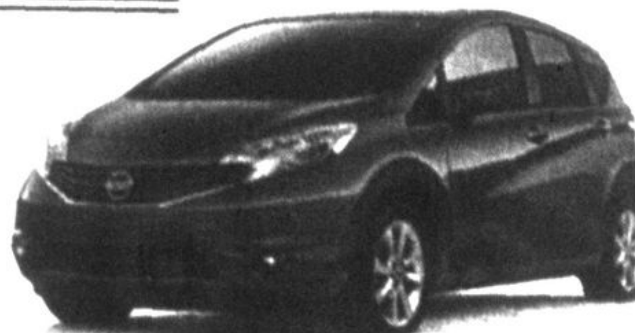
SL S1 model Shown*