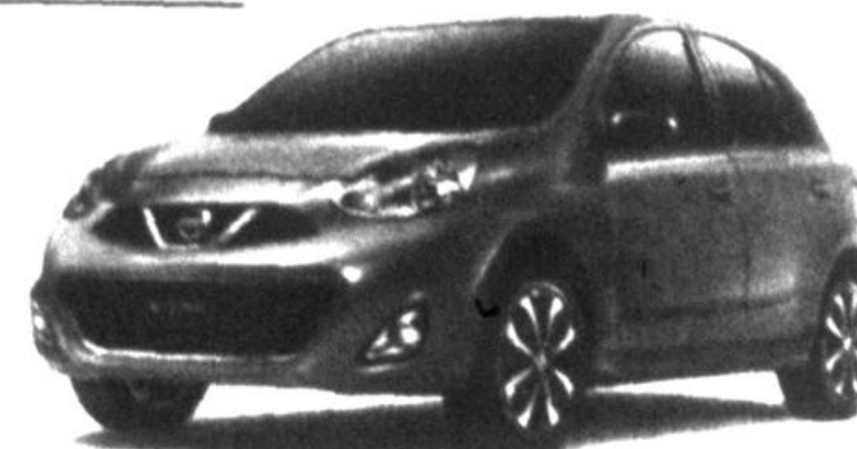
SR A1 model Shown*