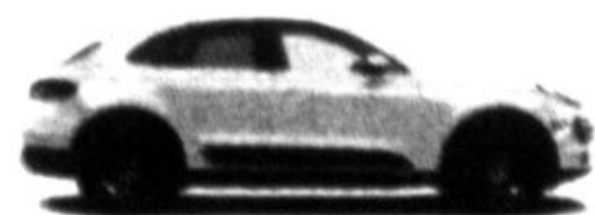
2015 Porsche Macan S 5,200km Over 80 Porsche models available

Visit www.pfaffauto.com/driveon for more details.