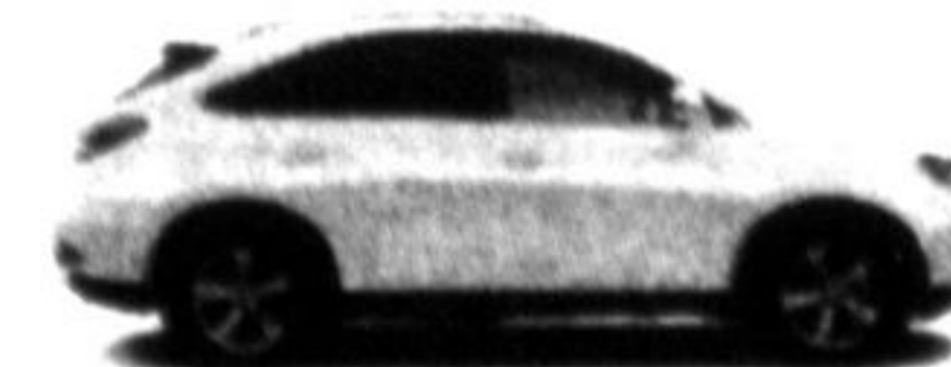
2010 Lexus RX350 114,861km Over 50 other makes and models available

BLACK FRIDAY DRIVE ON PRE-OWNED SALES EVENT