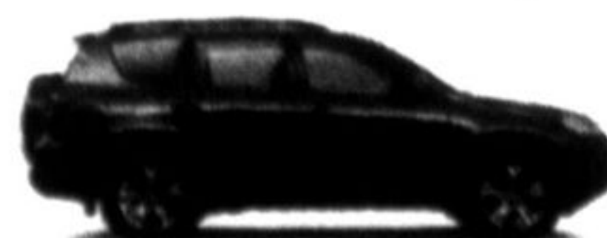
2011 Toyota RAV4 53,266km Over 30 Toyota models available