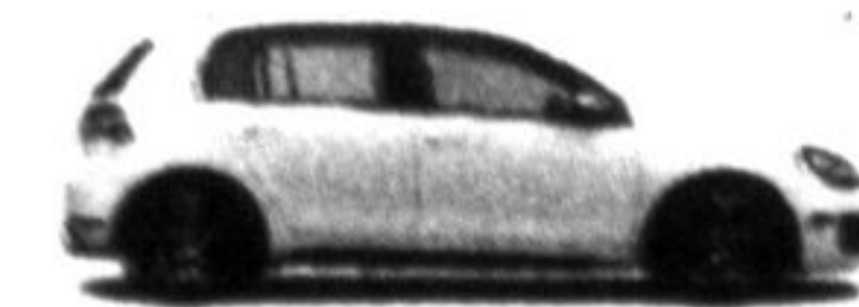
2011 VW GTI 81,585km Over 40 VW models available