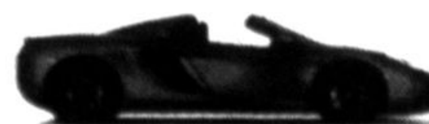
2013 McLaren MP4-12C 5,997km Over 5 McLaren models available