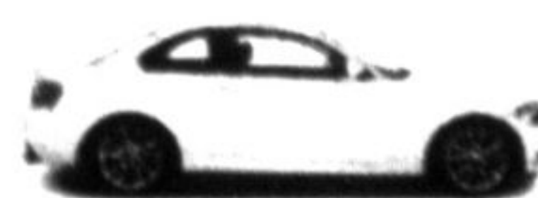
2011 BMW 135i 57,808km Over 80 BMW models available