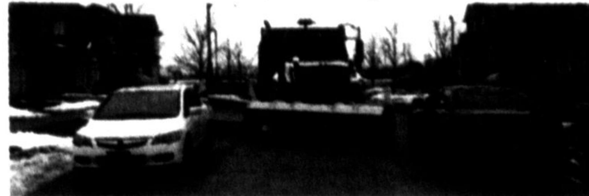
Avoid parking directly opposite a car already parked on the road.

Parking on both sides of the streets restricts access for emergency vehicles and snow plows. Help us keep the roads clear by NOT parking directly opposite a car that is already parked on the road. Wherever possible, please park in your garage or fully on your driveway. When it snows and if possible, please try to remove your vehicle off the road.