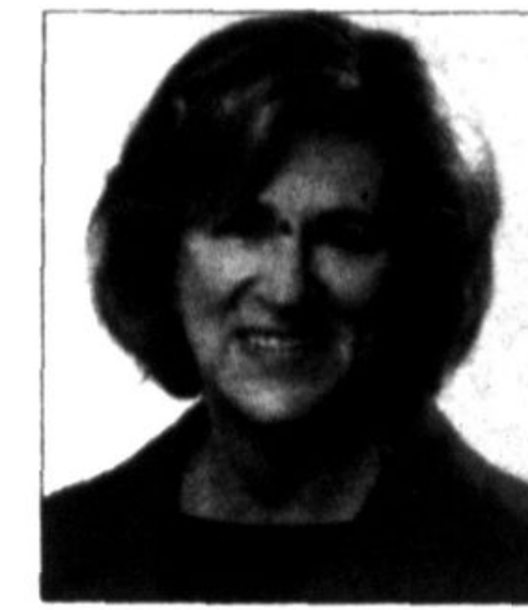
Dr. Helena Jaczek

As the former Medical Officer of Health for York Region for many years, I am con-