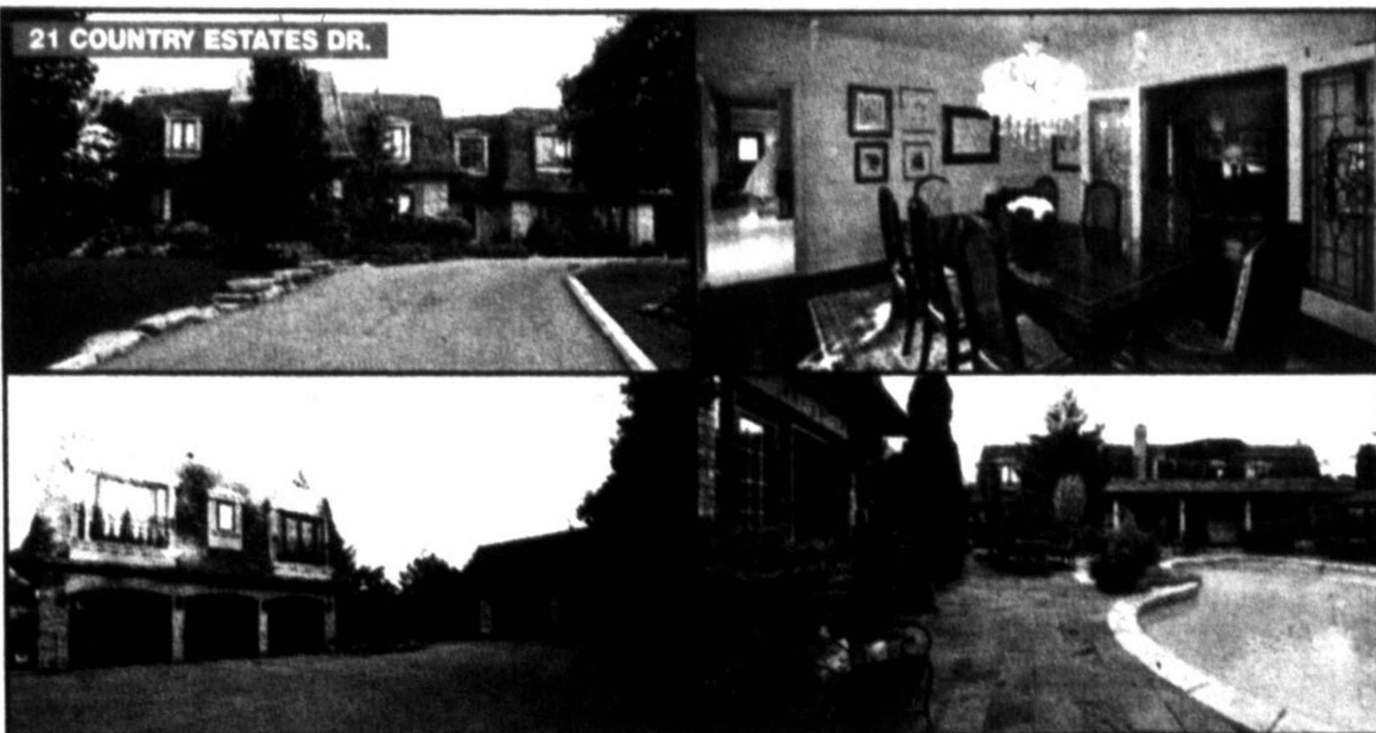
21 COUNTRY ESTATES DR.