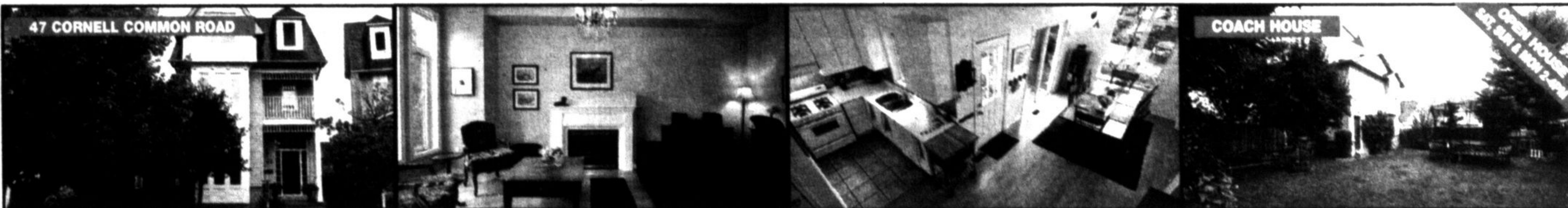
47 CORNELL COMMON ROAD