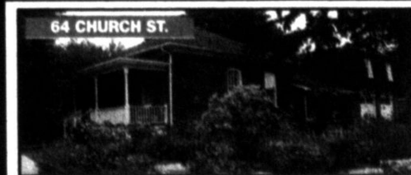
64 CHURCH ST.

Markham's Wismer community. Premium lot - 74.54' across rear 135.03' south side. Immaculate and bright Mattamy built detached 3bdrms (2 with large walk-in closets), 3 washrms. Oak hwd floors main & 2nd level plus staircase. Open concept kit/fam rm with eat-in kitchen & garden door w/walk-out to patio. Gas fireplace, window coverings incl. custom silk draperies, garage access. Walk to highly ranked schools. Call Sylvia Houghton* or Karen Harvey**