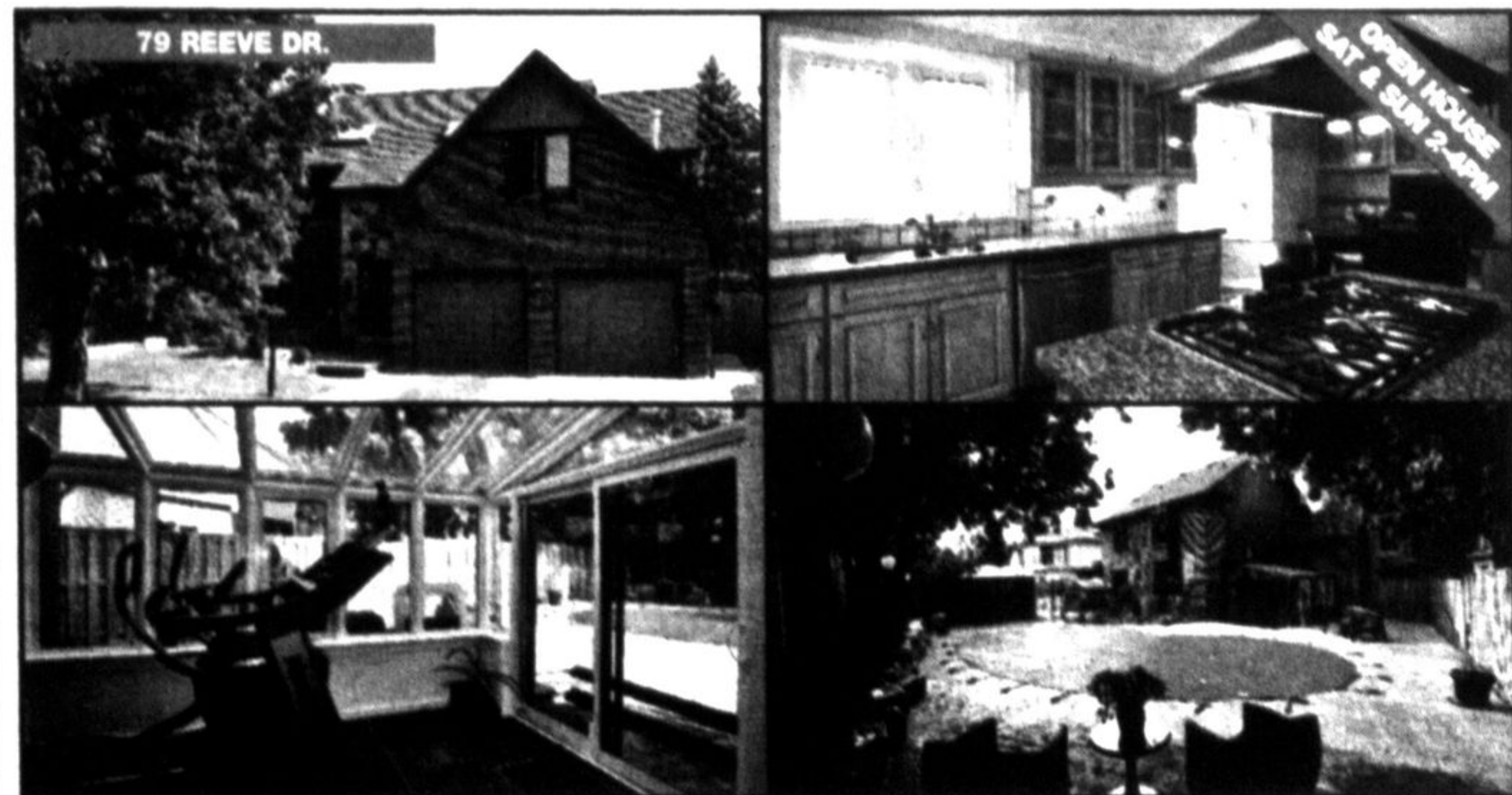
79 REEVE DR.