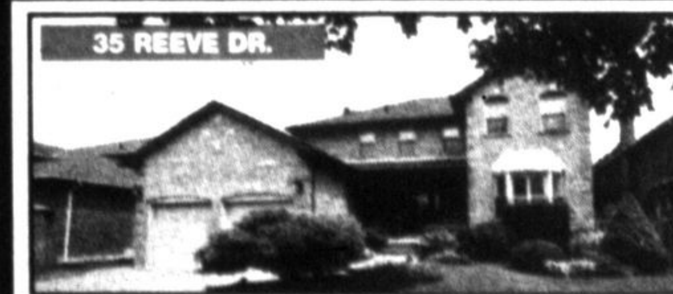
35 REEVE DR.