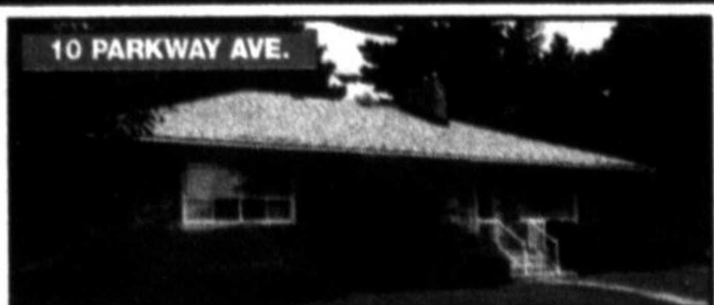
10 PARKWAY AVE.

"HOME IN THE HEART OF MARKHAM" - $1,977,000 3371 sq. ft. of luxury and class on 118' x 110' lot with heated inground pool. High ceiling, parlor, separate din. and 25' living room with fireplace. Fantastic country kitchen. 4 bedrooms, 2 car garage. Walk to all amenities. Sylvia Houghton* & David Houghton*, 905-947-9300