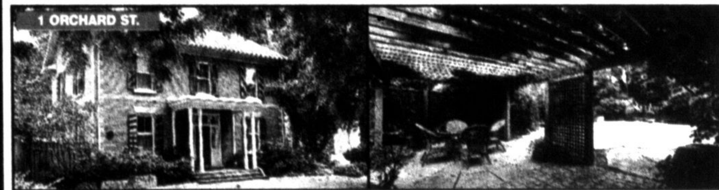
1 ORCHARD ST.

10,347 sq. ft. of total perfection. 5+2 bdrms, 9 baths. Inground heated pool with cabana. 4 car garage. Barzotti custom kitchen, pantry & butler pantry. W/O to custom deck with pizza oven, too. 3 fireplaces, theatre, wine cellar, 121' x 299' lot. A-M-A-Z-I-N-G. Sylvia Houghton*, 905-947-9300