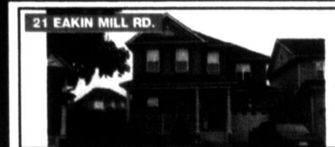
21 EAKIN MILL RD.

3 + 2 bedroom. Grand and gracious dining plus living with fireplace. 131' x 99' lot - magnificent. Walk to Main Street, Schools and GO train. Sylvia Houghton* & Derek Houghton**, 905-947-9300