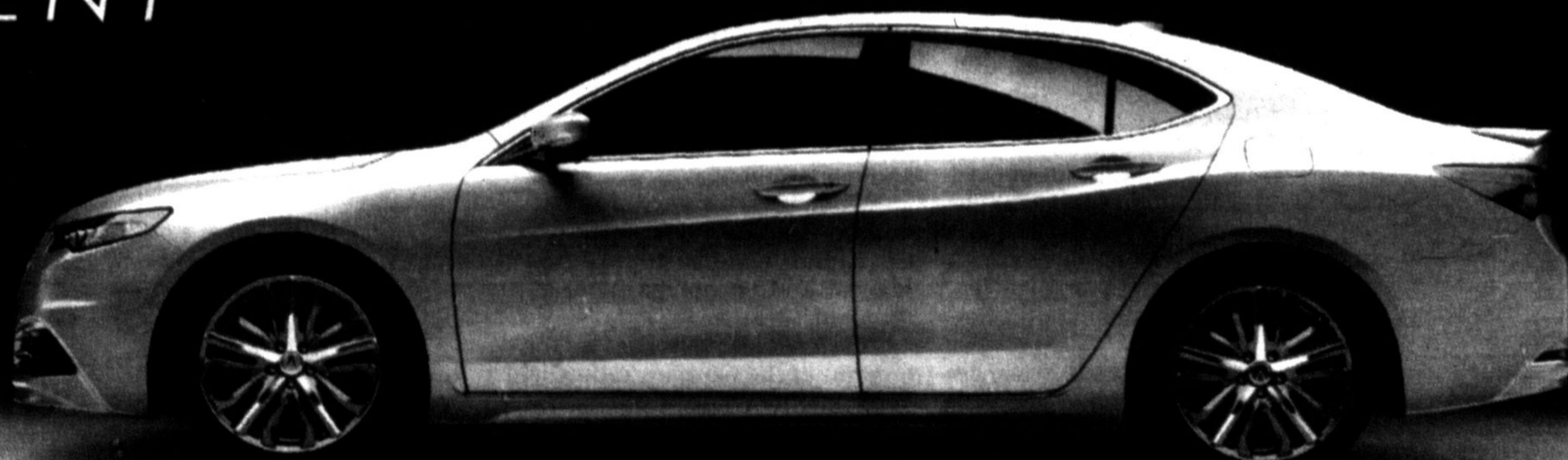
Model shown with Optional Launch Package

Introducing a performance sport-sedan like no other. With aggressive styling, ultra-modern technology features, precision-handling and a world-first 8-speed dual-clutch transmission with torque converter. The all-new 2015 Acura TLX. It's that kind of thrill.