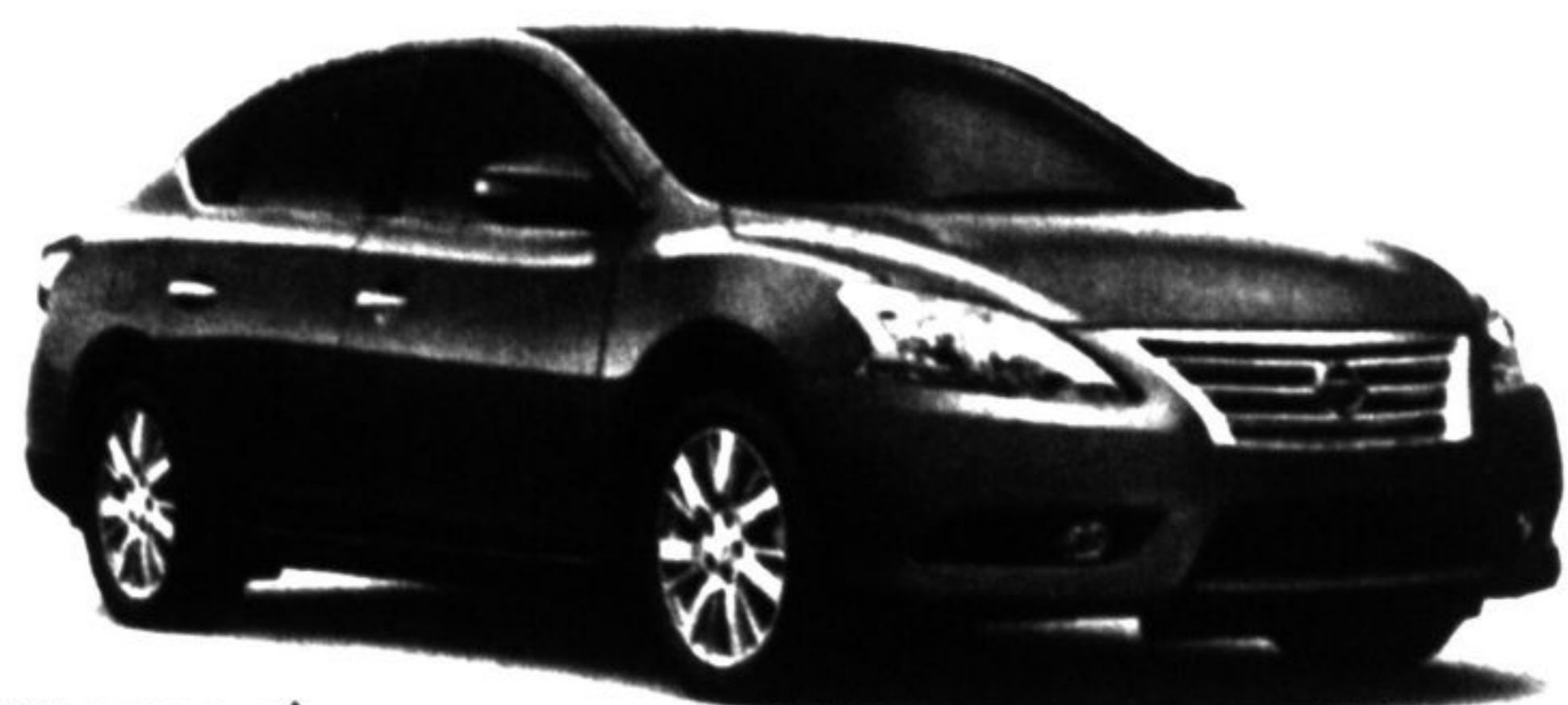
1.8 SL model shown*