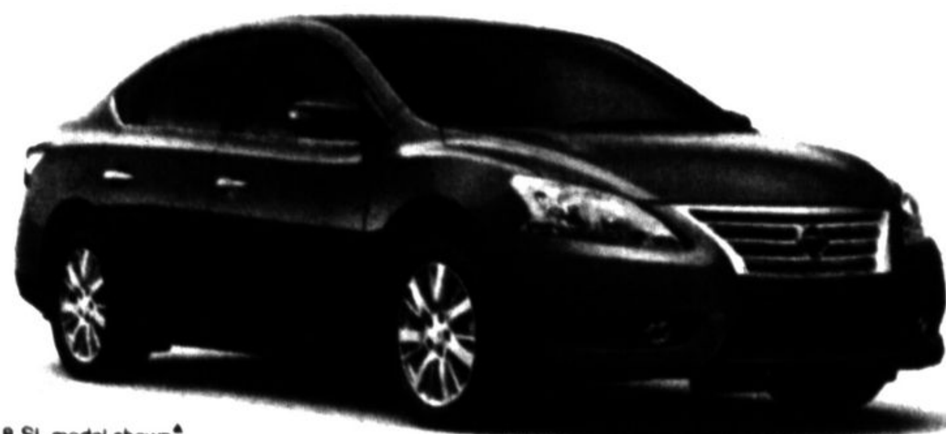
1.8 SL model shown*