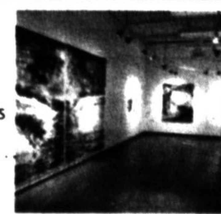
Image: Reservoir, installation shot