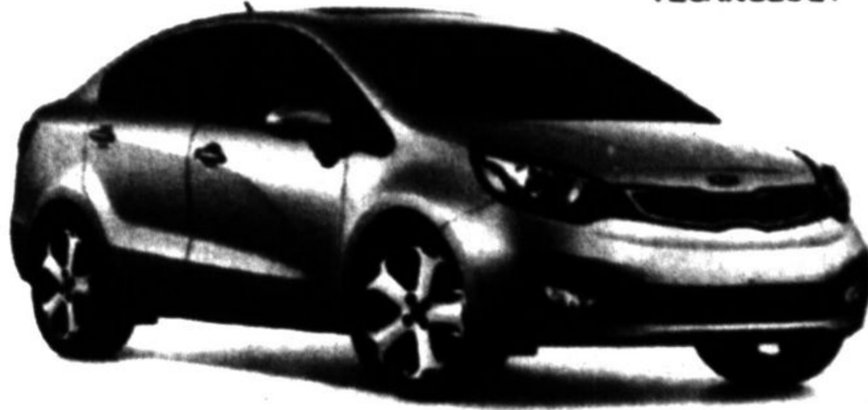
Rio4 SX with Navigation shown* Cash purchase price $22,714 - hwy / city 100km*: 5.3L/7.3L

2014 RIO BETTER FUEL EFFICIENCY WITH AVAILABLE ISG (IDLE STOP AND GO) TECHNOLOGY