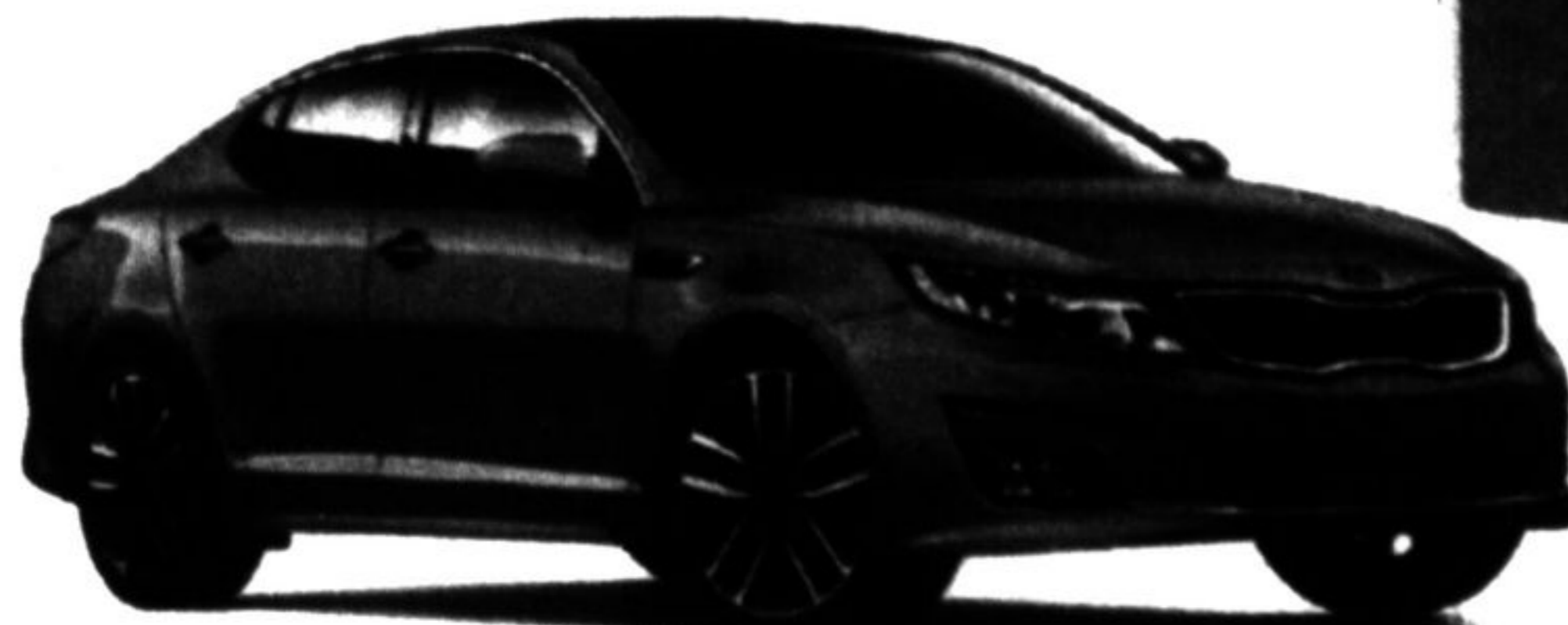
Optima SX Turbo AT shown* Cash purchase price $33,214 - hwy / city 100km*: 5.7L/8.9L