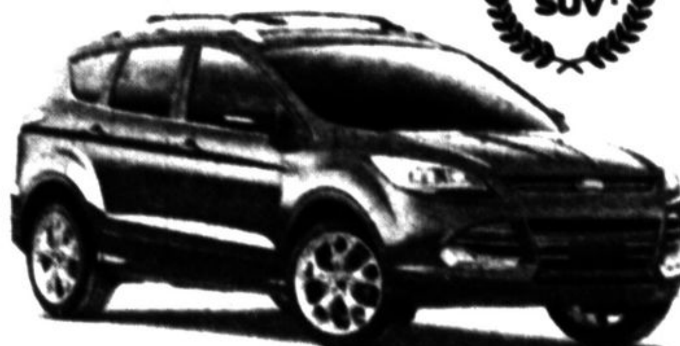
Escape Titanium model shown

PURCHASE FINANCE FOR ONLY $149** @ 1.99% APR $0 DOWN INCLUDES FREIGHT FINANCE BI-WEEKLY FOR 84 MONTHS WITH