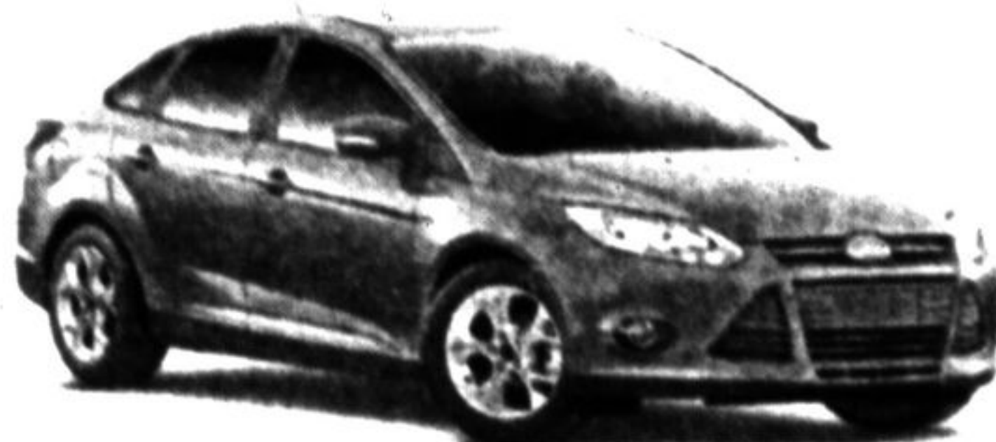
Focus Titanium model shown

PURCHASE FINANCE FOR ONLY $85** @ 0.99% APR $0 DOWN INCLUDES FREIGHT FINANCE BI-WEEKLY FOR 84 MONTHS WITH