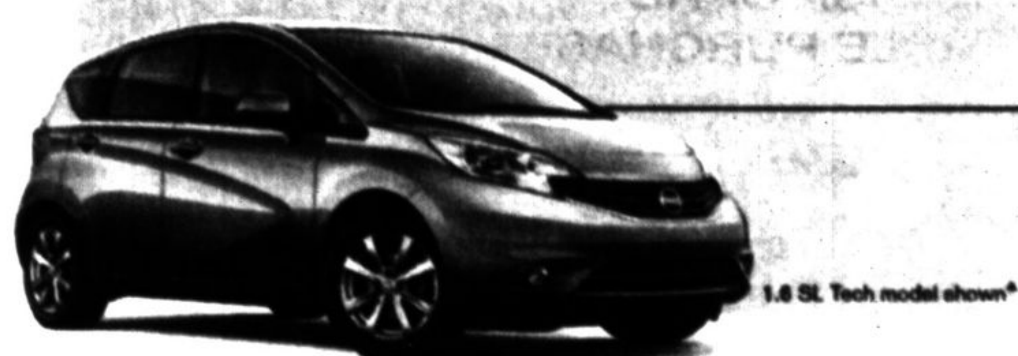
2014 NISSAN VERSA NOTE

$3,500 CASH DISCOUNT ON SENTRA 1.8 S VOP PACKAGE