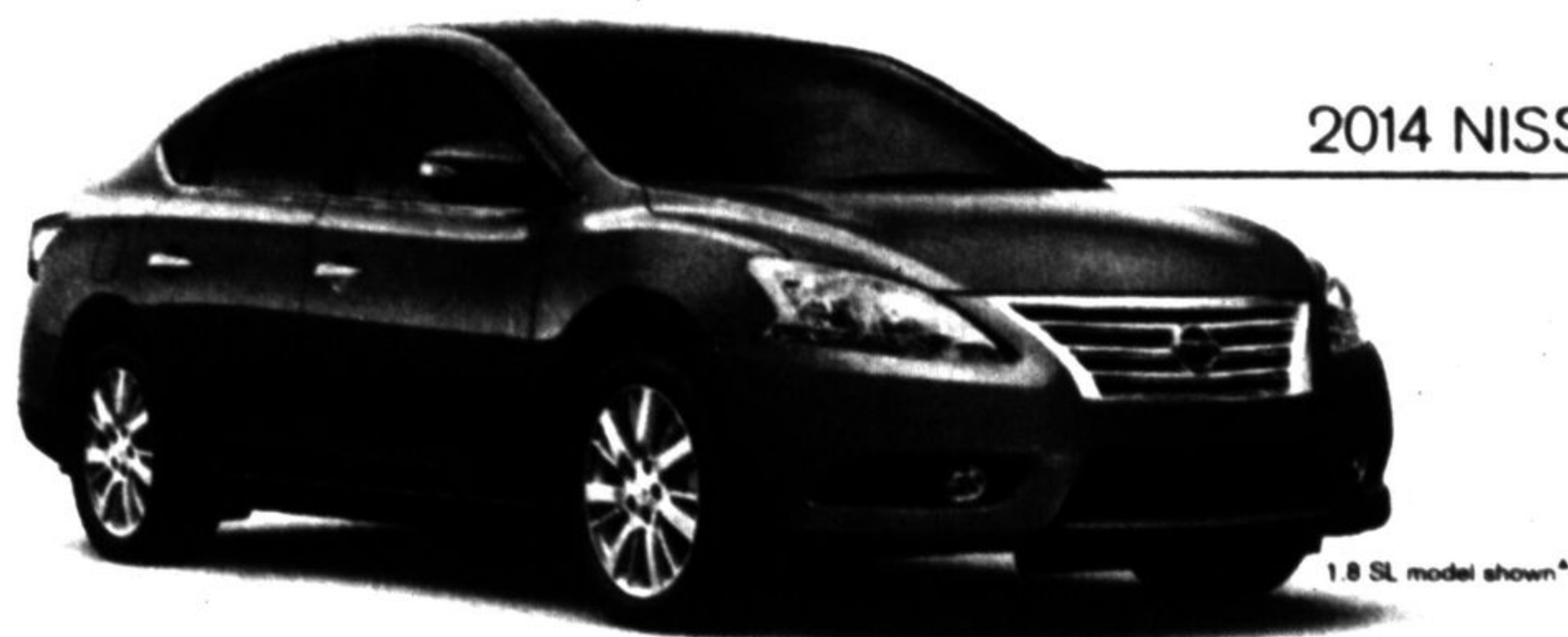
2014 NISSAN SENTRA

• BETTER COMBINED FUEL EFFICIENCY THAN CIVIC AND ELANTRA • STANDARD HEADLIGHT LED ACCENTS AND LED TAILLIGHTS