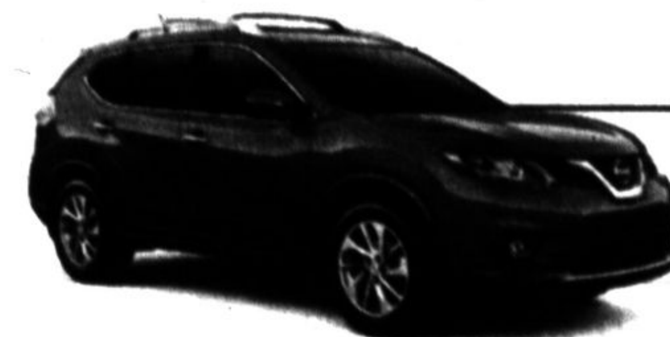
SL AWD Premium model shown with Accessory Roof Rail Crossbars*

LEASE FROM $69 AT 0% PER MONTH $0 FREIGHT AND $1,000 INCLUDES SEMI-MONTHLY* APR DOWN FEES INCLUDED BONUS CASH