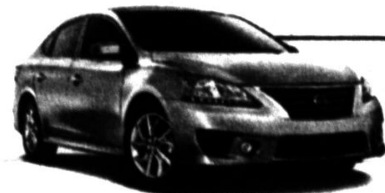
SR model shown*