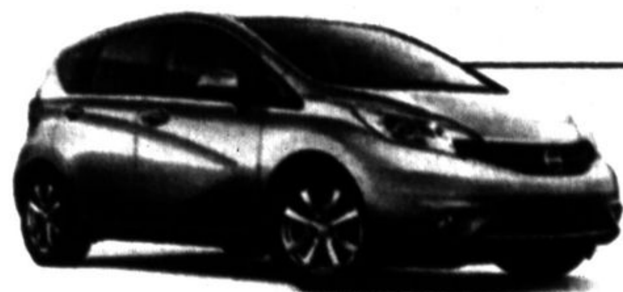
1.6 SL Tech model shown*