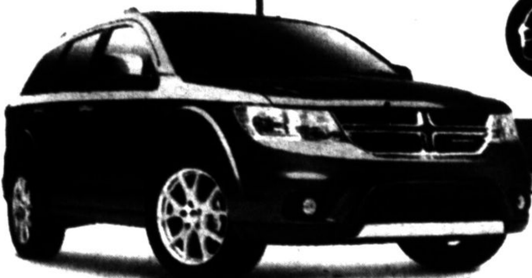
Starting From Price for 2014 Dodge Journey R/T AWD shown: $32,390. 1

59 MPG HIGHWAY FINANCE FOR $91 @ 2.79% BI-WEEKLY! FOR 96 MONTHS WITH $0 DOWN AVAILABLE FEATURES • All-Speed Traction Control System • Four-channel antilock brakes • Four-wheel disc brakes • Hill start assist • Ready-Alert Braking & Panic Brake Assist • Ten air bags • All-season tires • Audio jack input for mobile devices • Bi-functional halogen headlamps • Body colour power mirrors • Electronic stability control & roll mitigation • Keyless entry with panic alarm • Power windows, driver one touch up/down • Uconnect™ 200 AM/FM/CD/MP3 • Remote fuel door release