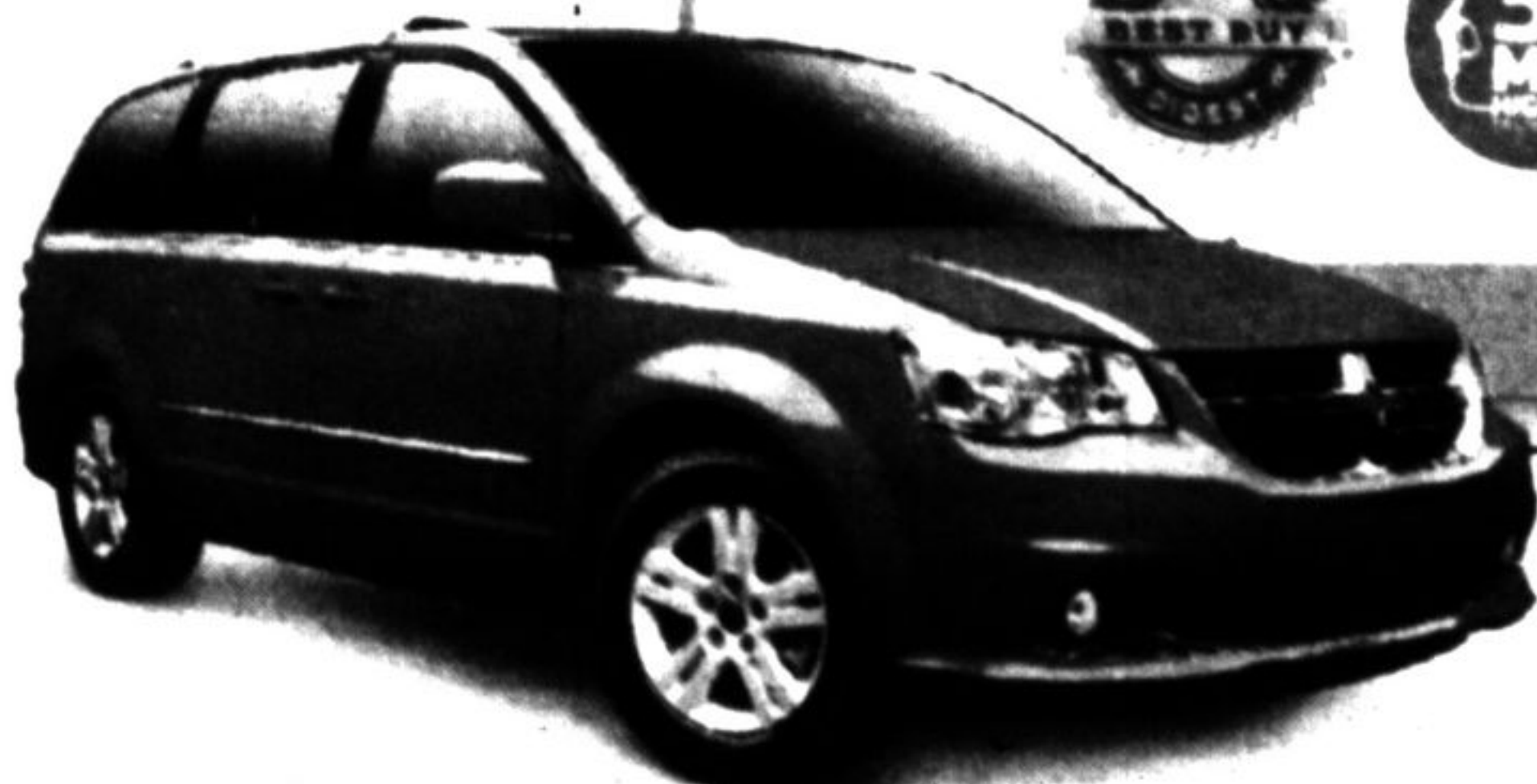
Starting From Price for 2014 Dodge Grand Caravan Crew Plus shown: $32,990. 1

PULL-AHEAD BONUS CASH $1,000 + 1% RATE REDUCTION PULL-AHEAD INTO A NEW VEHICLE SOONER EXCLUSIVE TO OUR EXISTING FINANCE/LEASE CUSTOMERS.