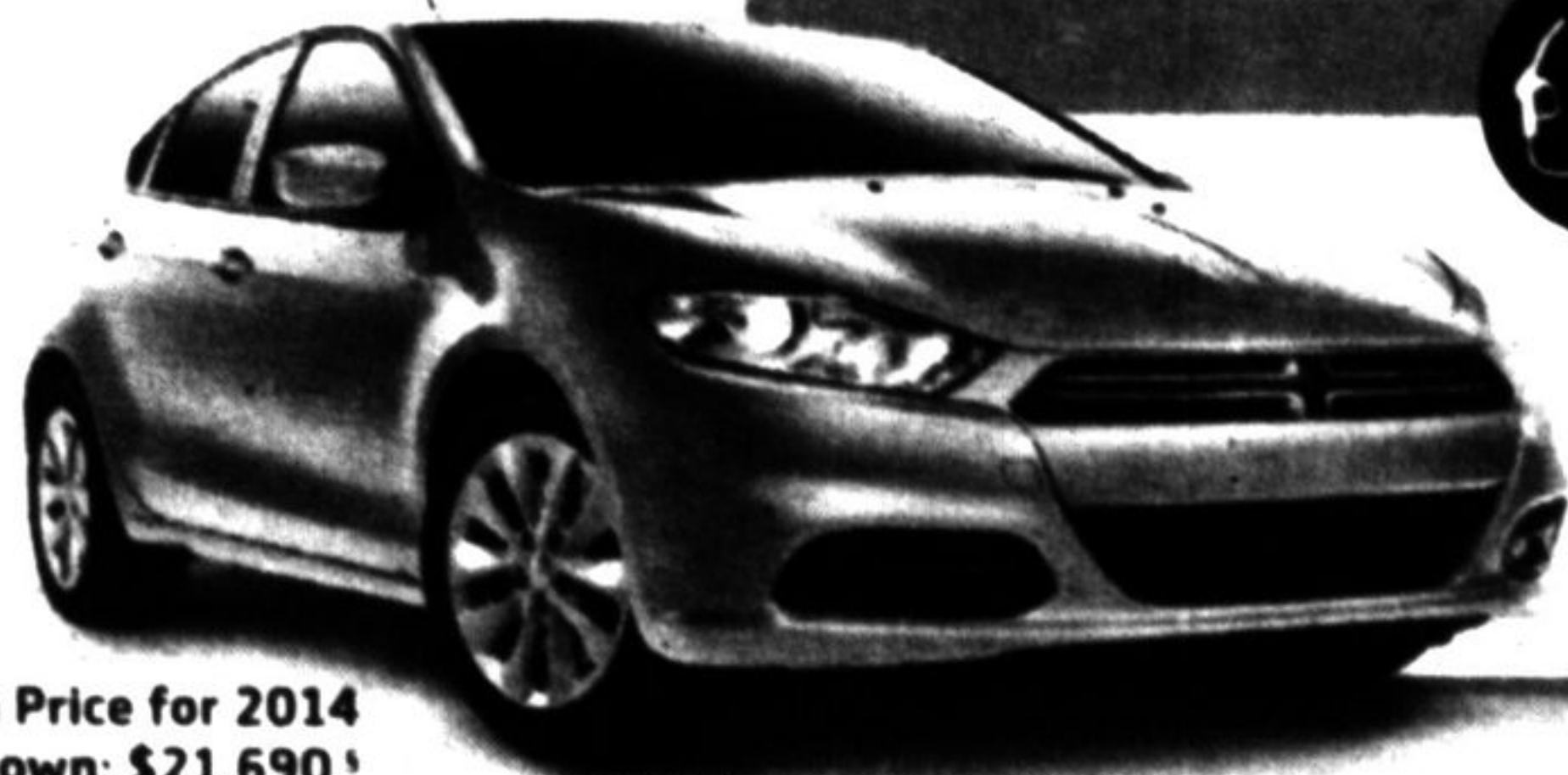
Starting From Price for 2014 Dodge Dart Aero shown: $21,690. 1

PURCHASE PRICE INCLUDES $8,100 CONSUMER CASH, 3 FREIGHT, AIR TAX, TIRE LEVY AND OMVIC FEE. TAXES EXCLUDED. OTHER RETAILER CHARGES MAY APPLY. 4