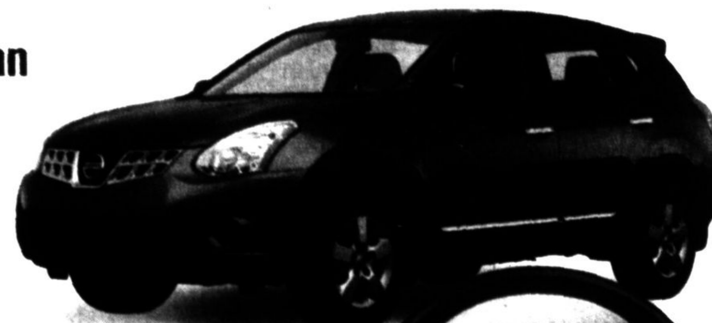
2013 Nissan Rogue FWD S

$15998 and CASH PRICE Financing at 0% for 24 Months