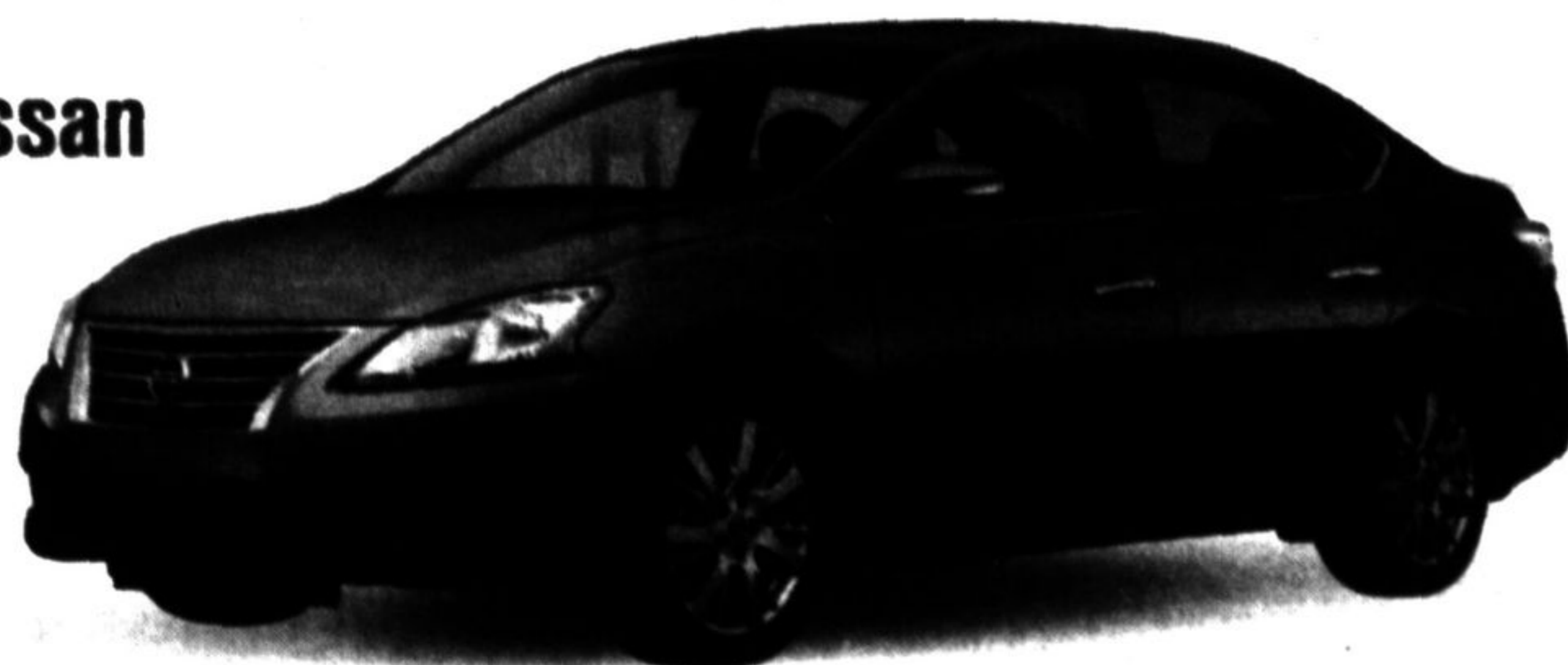
2013 Nissan Sentra 2.0

$15998 and CASH PRICE Financing at 0% for 24 Months