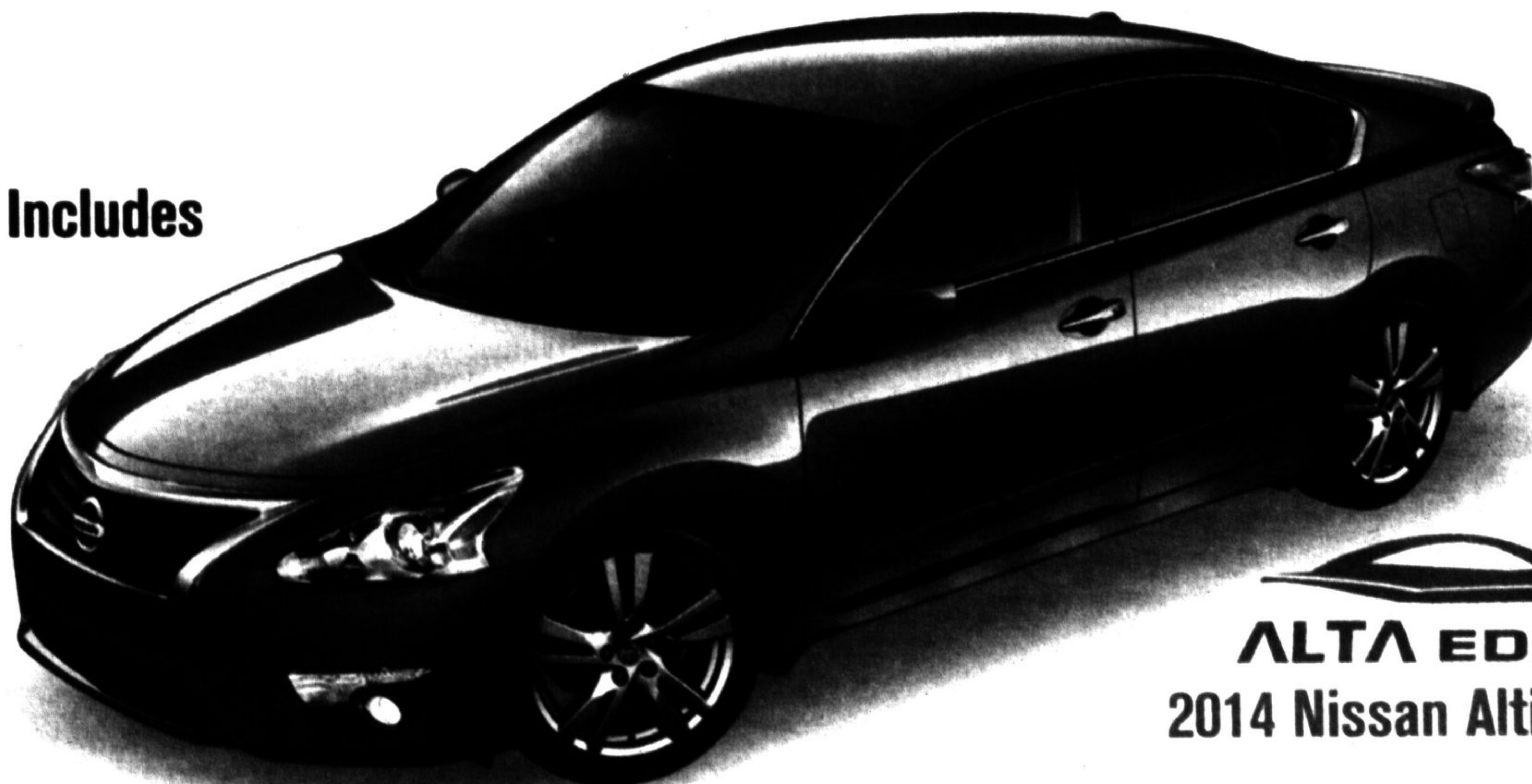
ALTA EDITION 2014 Nissan Altima 2.5S

LEASE FOR $158* s/mth 2.9% Lease Rate $0 Downpayment 60 Months