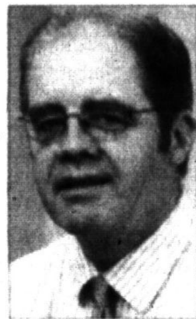
Off The Top

W e played Santa this week. Not the gin-soaked, X-rated Billy Bob Thornton version either.