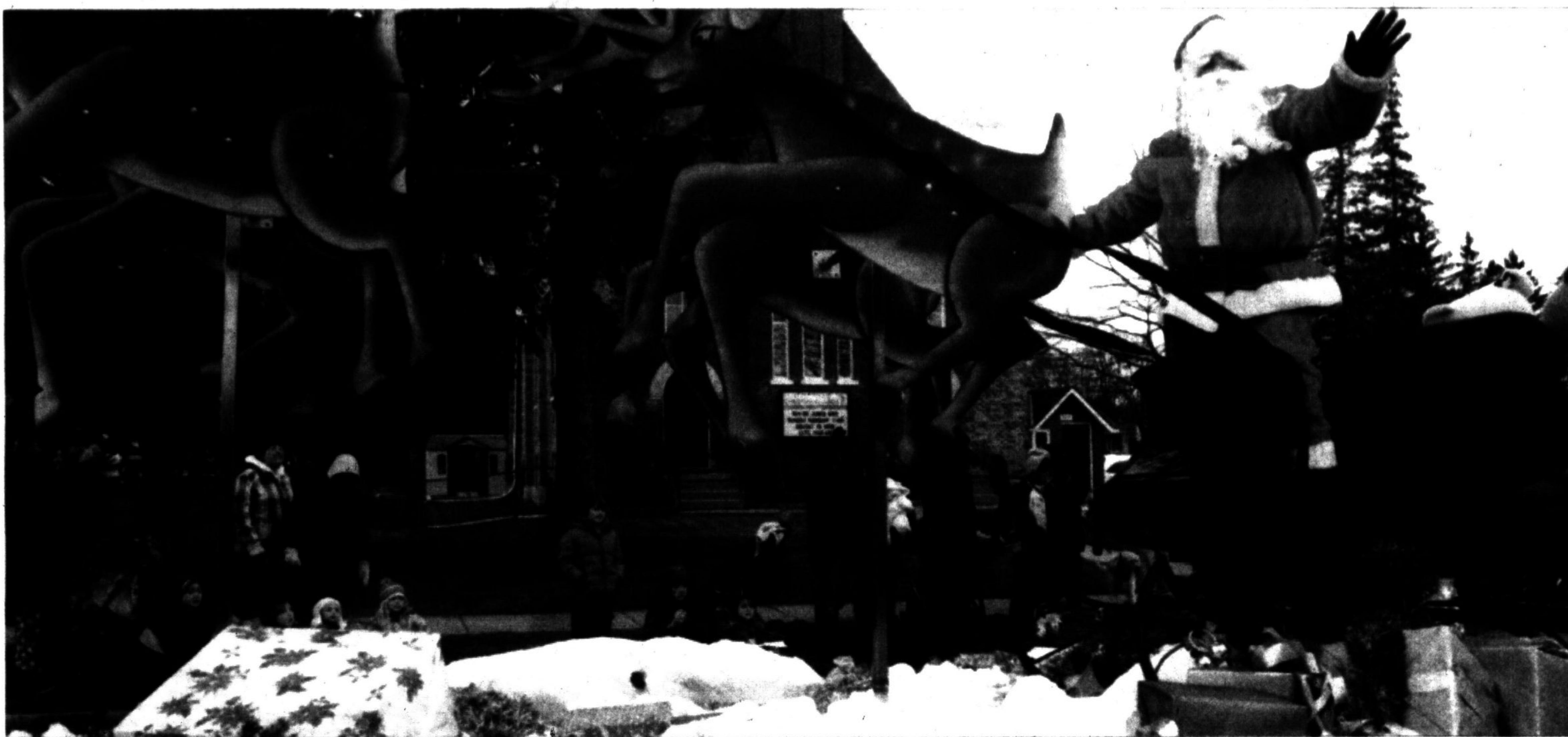
Santa greets his fans at Main and Stouffer streets during the Kinsmen Santa Claus Parade Saturday. More photos on yorkregion.com. Who won awards? See page 10.