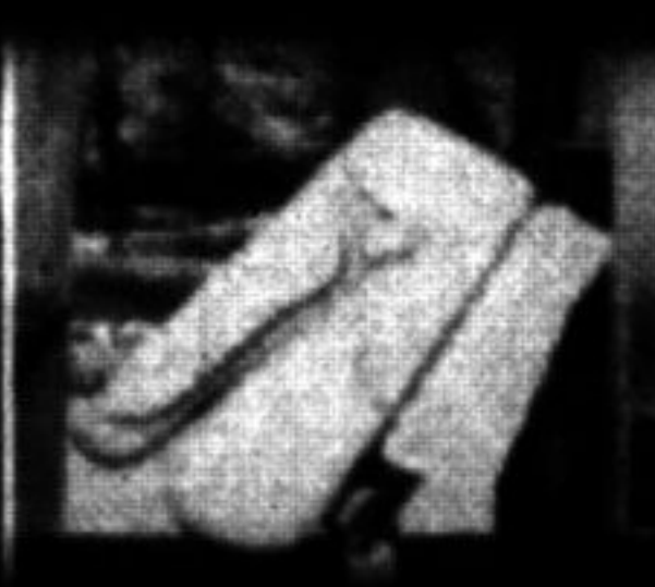
2ND ROW SUPER STOW 'N' GO