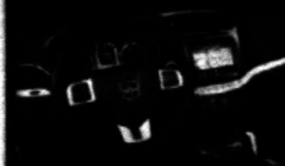
PREMIUM SOFT-TOUCH INTERIOR