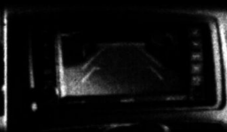
PARKVIEW REAR BACK-UP CAMERA