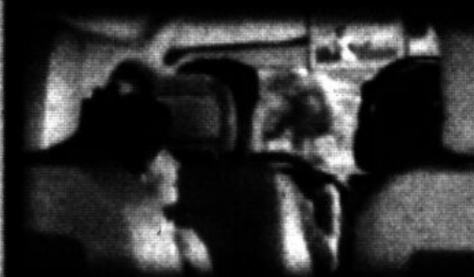
2ND ROW OVERHEAD 9-INCH VIDEO SCREEN