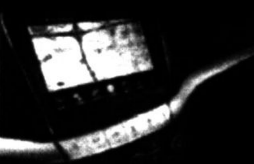
LARGEST TOUCH SCREEN IN ITS CLASS