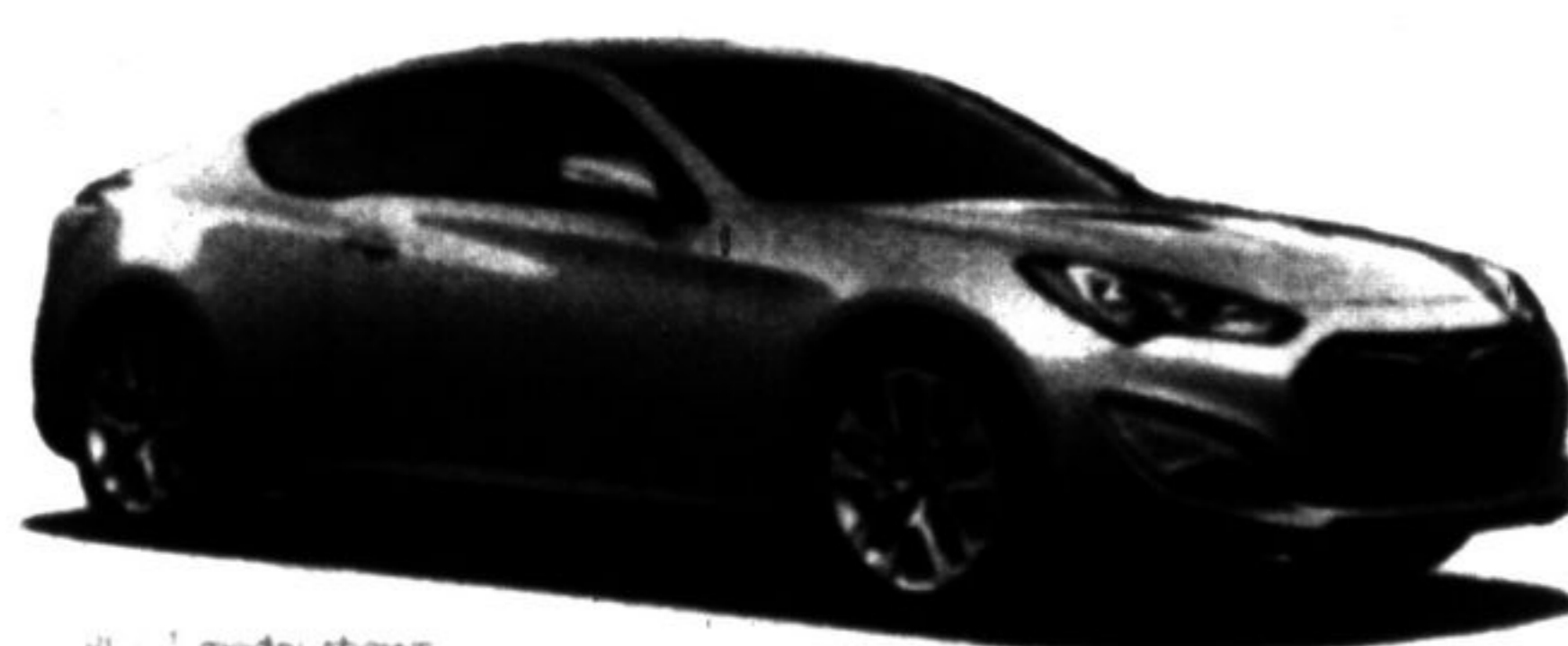
All model shown

SELLING PRICE $24,700* GENESIS COUPE 2.0T 6-SPEED MANUAL $3,500 IN PRICE ADJUSTMENTS, FEES, DELIVERY & DESTINATION INCLUDED, PLUS HST