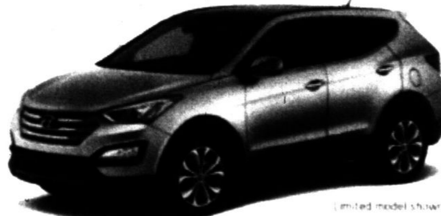
Limited model shown

SELLING PRICE $26,395* SANTA FE 2.4L FWD AUTO $2,000 IN PRICE ADJUSTMENTS, FEES, DELIVERY & DESTINATION INCLUDED, PLUS HST