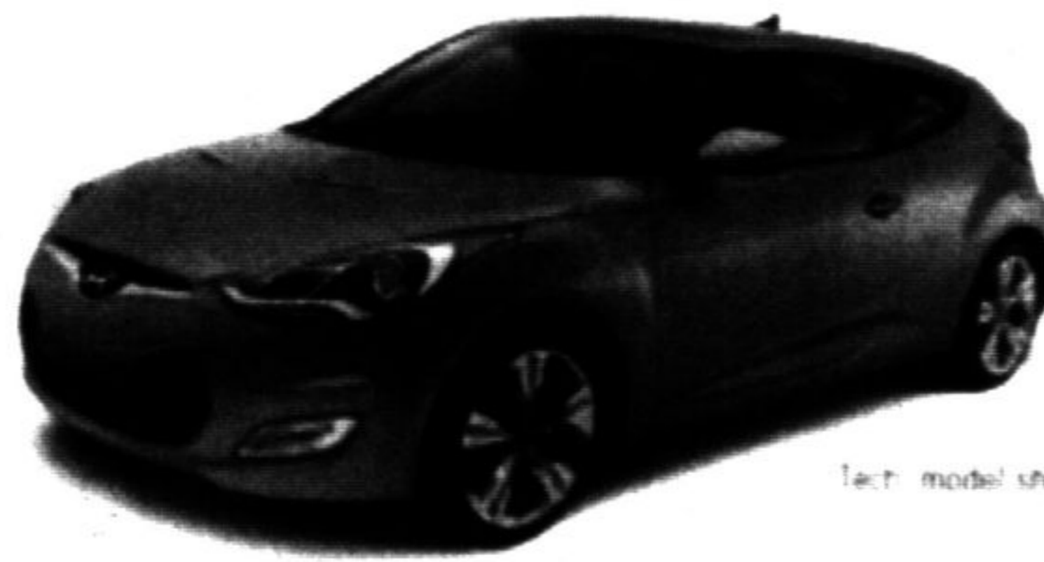
Left model shown

SELLING PRICE $18,330* VELOSTER 6-SPEED MANUAL $3,000 IN PRICE ADJUSTMENTS, FEES, DELIVERY & DESTINATION INCLUDED, PLUS HST