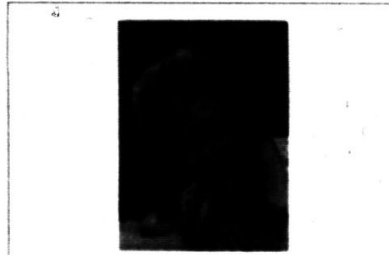
Bessey, Emily June June 25, 1923 - July 7, 2013

TWO DAY AUCTION SALE Wed. July 17 & Thurs. July 18 @ 8:30pm POLLARDS AUCTION BARN 25 mi. E. of Keswick, 24190 Kennedy Rd. 15 mi. N. of Newmarket, off Woodbine Ave. (Watch for signs) Complete line of household furniture, Antique pcs, collectibles & tools. Check the web site, www.pollardsauctions.com for photos & additions 905-722-3112 SUTTON 905-476-5160