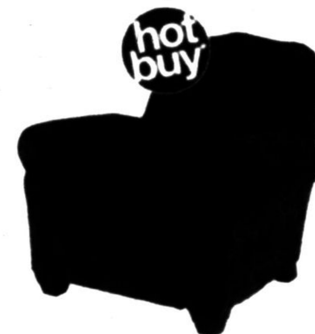
FARIS fabric recliner

Available in 1 Leather Colour Only - As Shown Matching Sofabed - now $2098