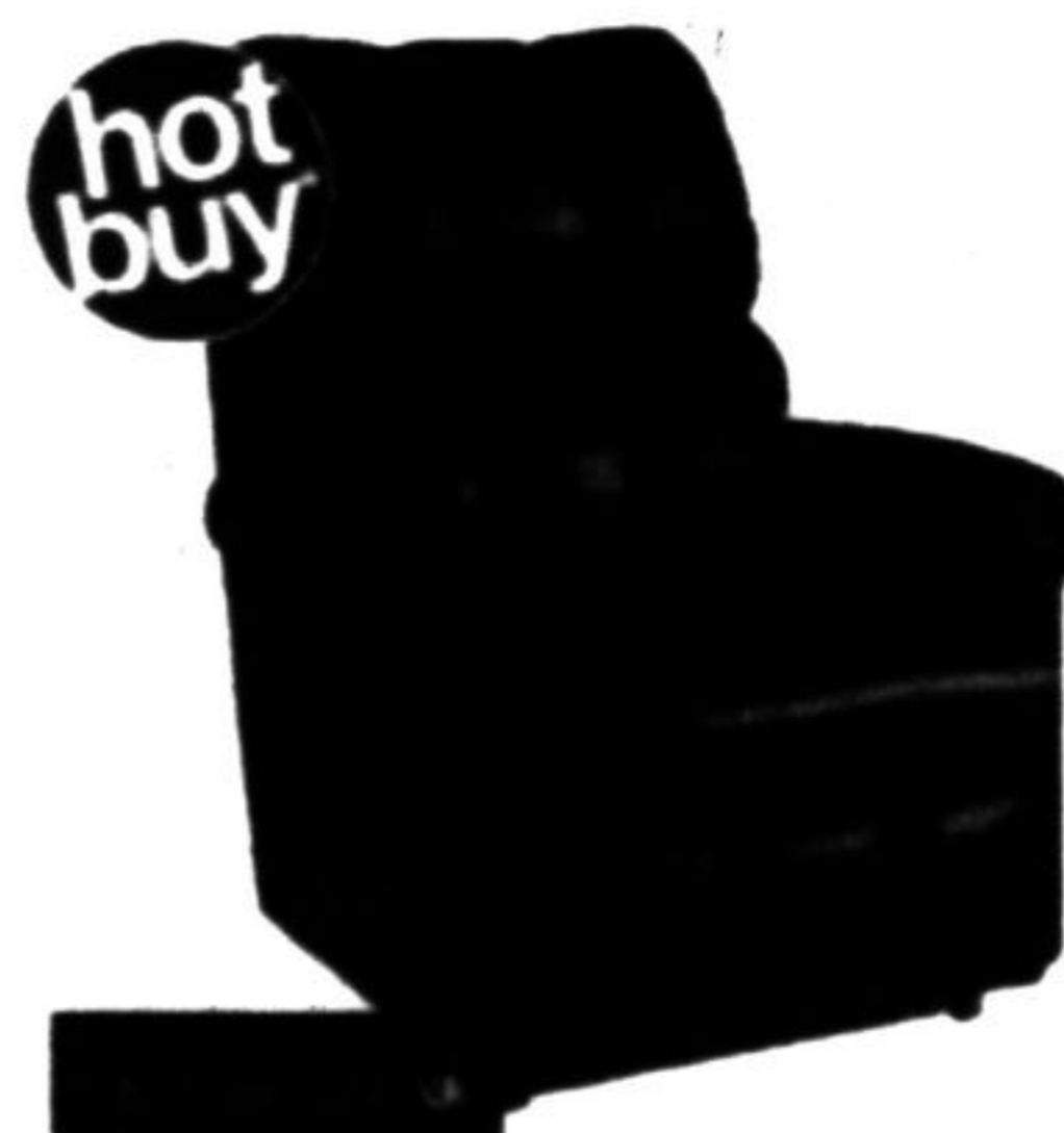
VAIL leather seating rocker recliner