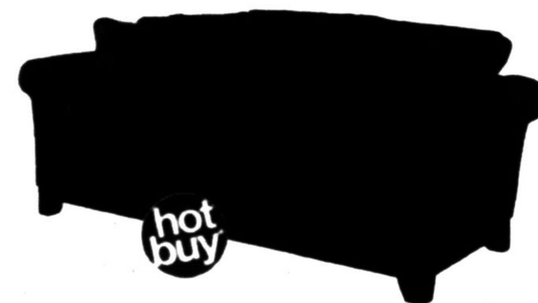
QUINN fabric stationary sofa

3 Leather Colours Available Upgrade to Power Recline + $400