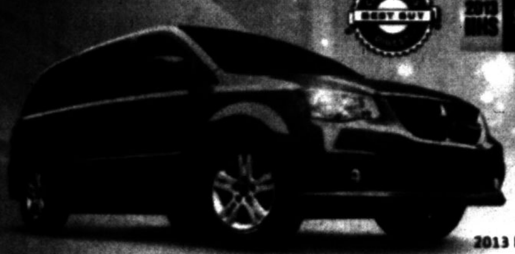
2013 Dodge Grand Caravan Crew Plus shown. 1

LIMITED TIME OFFER $1,000 GAS CARD GIFT 7 GAS CARDS AVAILABLE HURRY! OFFER ENDS JULY 2