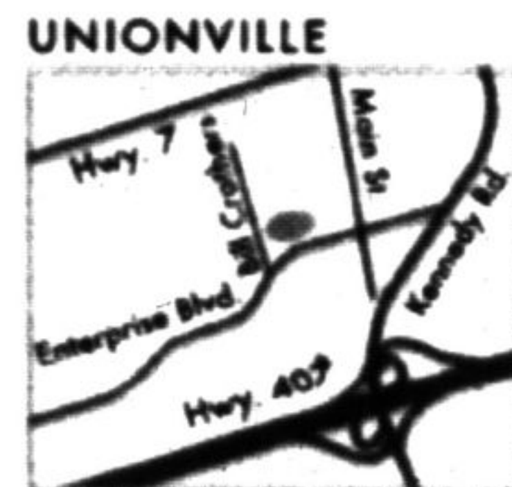
34 Main St., Unionville, ON - Enter off Bill Crothers

For more information and future updates visit themarleigh.ca or call 905-947-9990.