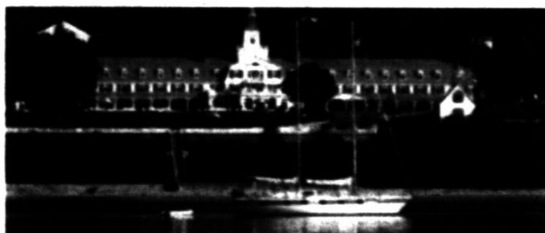
Whale Watching and Maritime Charm in Quebec Hotel in Quebec City, Quebec