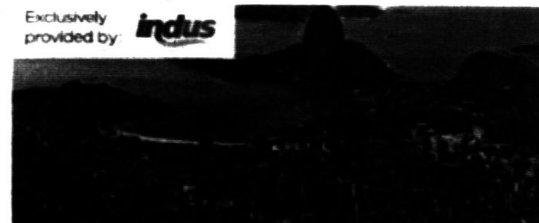
Epic Journey through Peru, Brazil and Argentina South American Wonders. Air Included