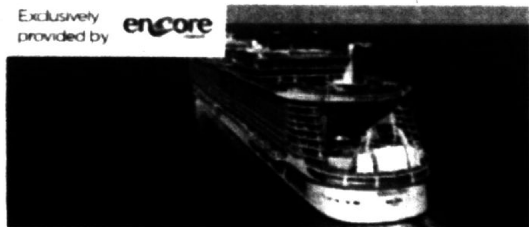
Sunshine and Serenity on a Caribbean Cruise $179 Cruise in the Great Western Lakes Region