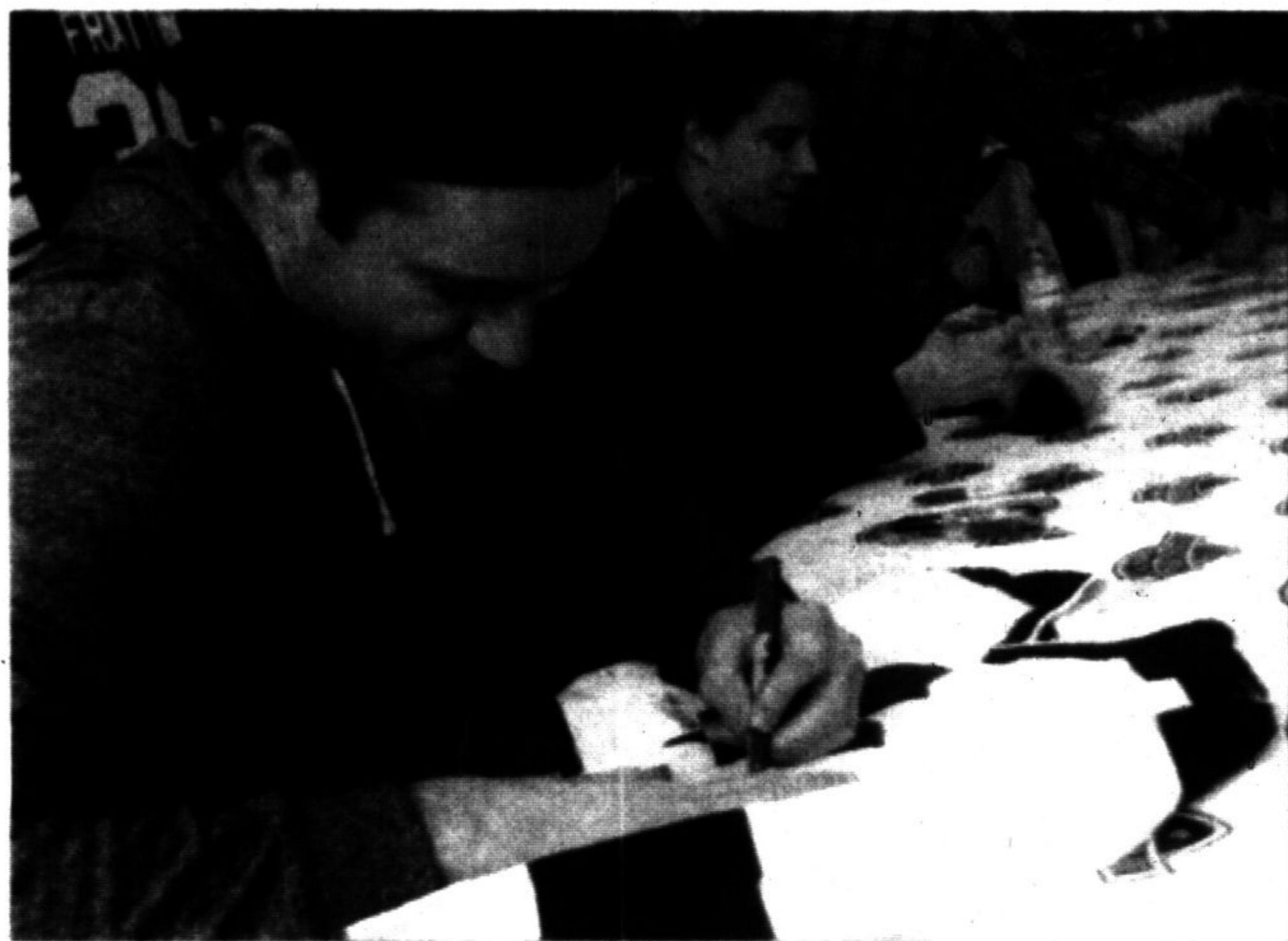
Cody Franson (left) and Matt Frattin of the Maple Leafs sign for fans.