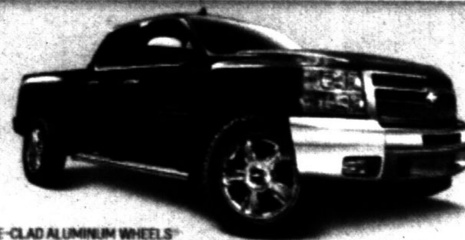
LT CREW CAB THUNDER EDITION WITH CHROME-CLAD ALUMINUM WHEELS*

TO GUARANTEE OUR QUALITY, WE BACK IT 160,000-KM/5-YEAR POWERTRAIN WARRANTY