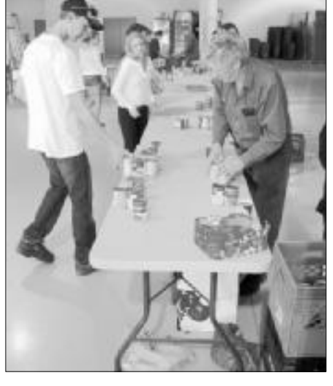
Canned food is taken for packing.

The food bank is located in Churchill church, near Musselman's Lake. -Sandra Bolan