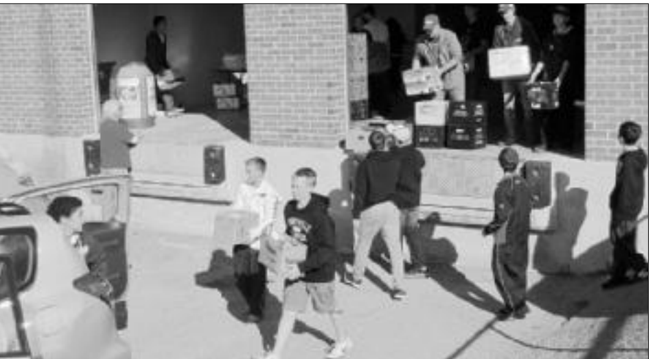
Volunteers load up donations headed for the food bank near Musselman's Lake.