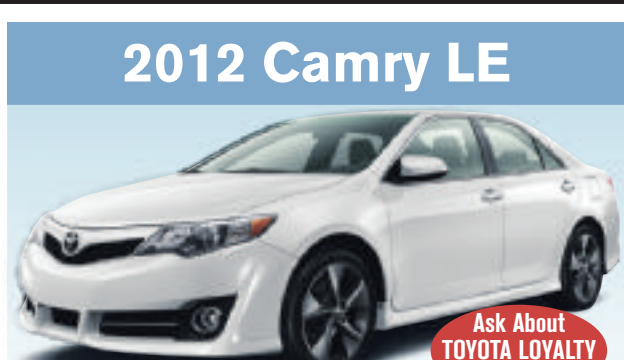
2012 Camry LE

all-in lease $315* @ 3.9% APR | 0.9% APR | up to $1,000 per month for 60 months. Includes freight and fees. HST extra. up to $1,000 Total Cash Incentives Purchase financing for 48 months. Cash Incentive HWY 5.6L/100 KM (50 MPG) $0 DOWN PAYMENT $0 SECURITY DEPOSIT