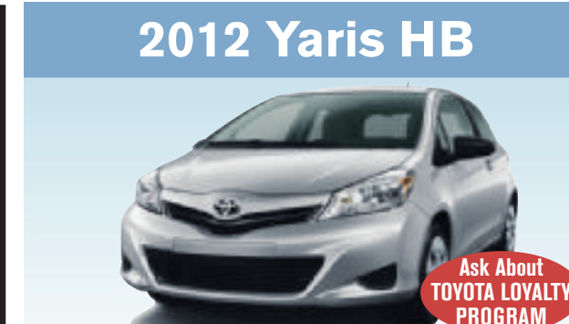
2012 Yaris HB

all-in lease $194* @ 2.9% APR | 0.9% APR per month for 60 months with $0 Down. Freight and Fees included. HST extra. Purchase financing for 36 months. HWY 5.2L/100 KM (54 MPG) $0 DOWN PAYMENT $0 SECURITY DEPOSIT