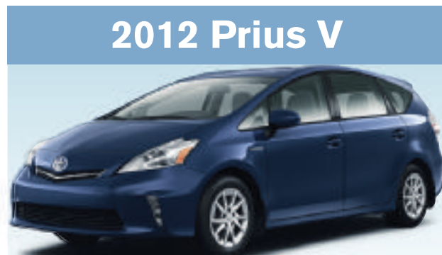
2012 Prius V

Lease & Finance Rates AS LOW AS 0% AS HIGH AS $8,000 Rebates