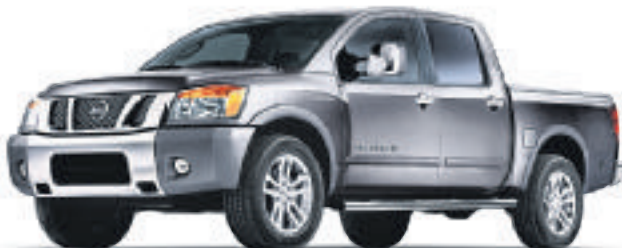
Crew Cab SL 4X4 model shown*

UP TO $13,500 ^ IN DISCOUNTS FOR CASH PURCHASERS