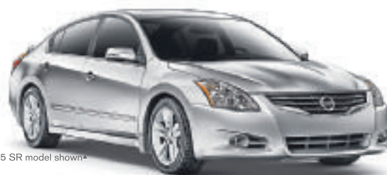
3.5 SR model shown*

UP TO $8,100 ^ IN DISCOUNTS FOR CASH PURCHASERS