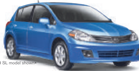
1.8 SL model shown*