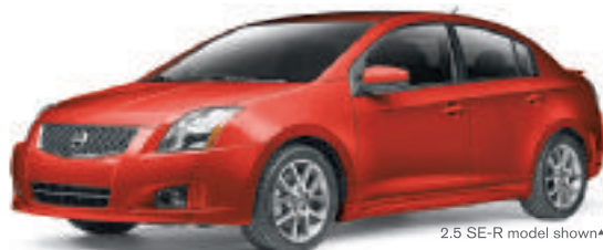
2.5 SE-R model shown*