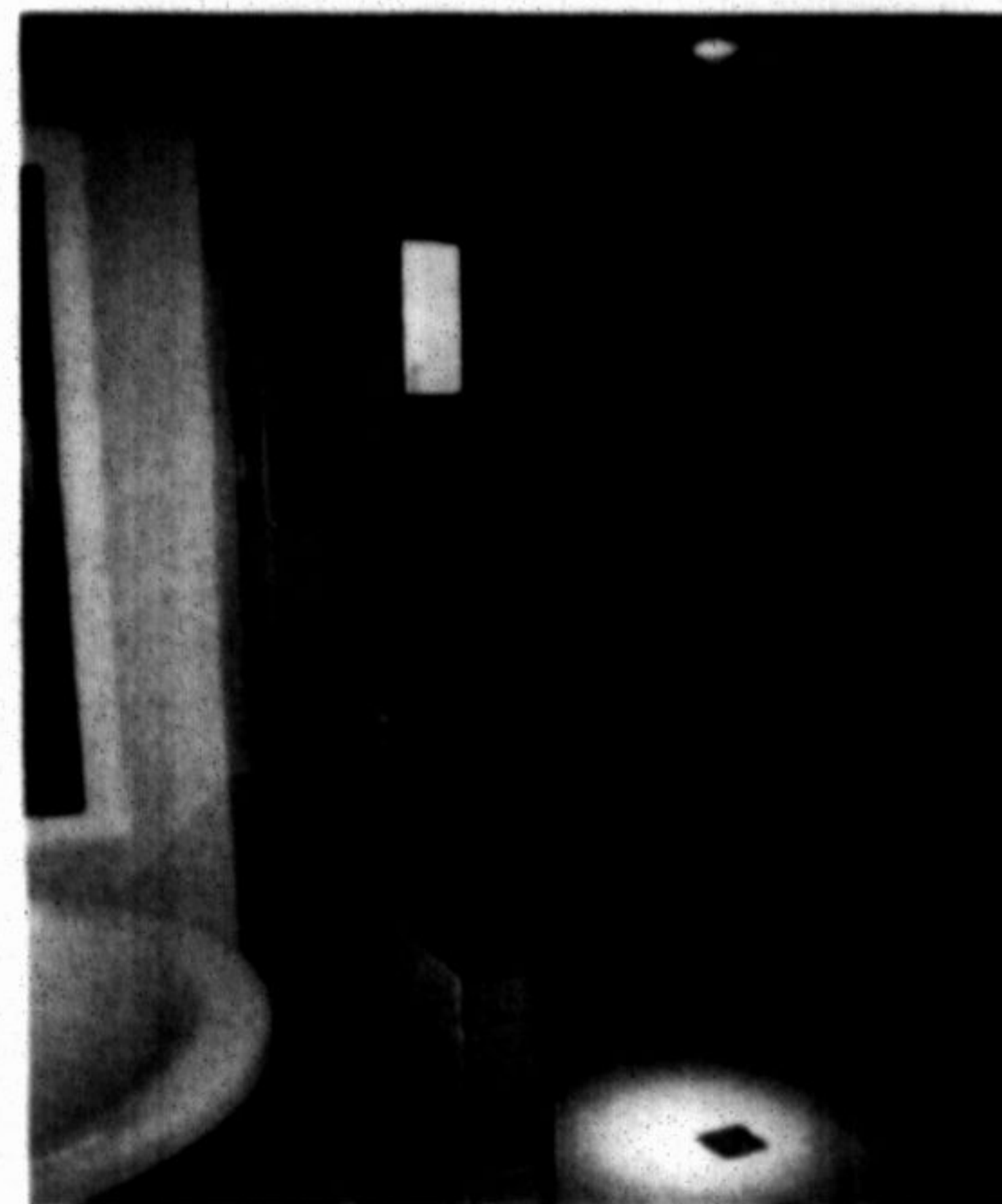
Ensure that your shower is eco-friendly.

valves, which allow non-aerated jets to reduce heat loss. Other flow restrictors inadvertently reduce water pressure, so be sure to do your research before buying one. For taps equipped with pressure reducers, aerators can be installed so that air is mixed into the water stream for consistent shower pressure.