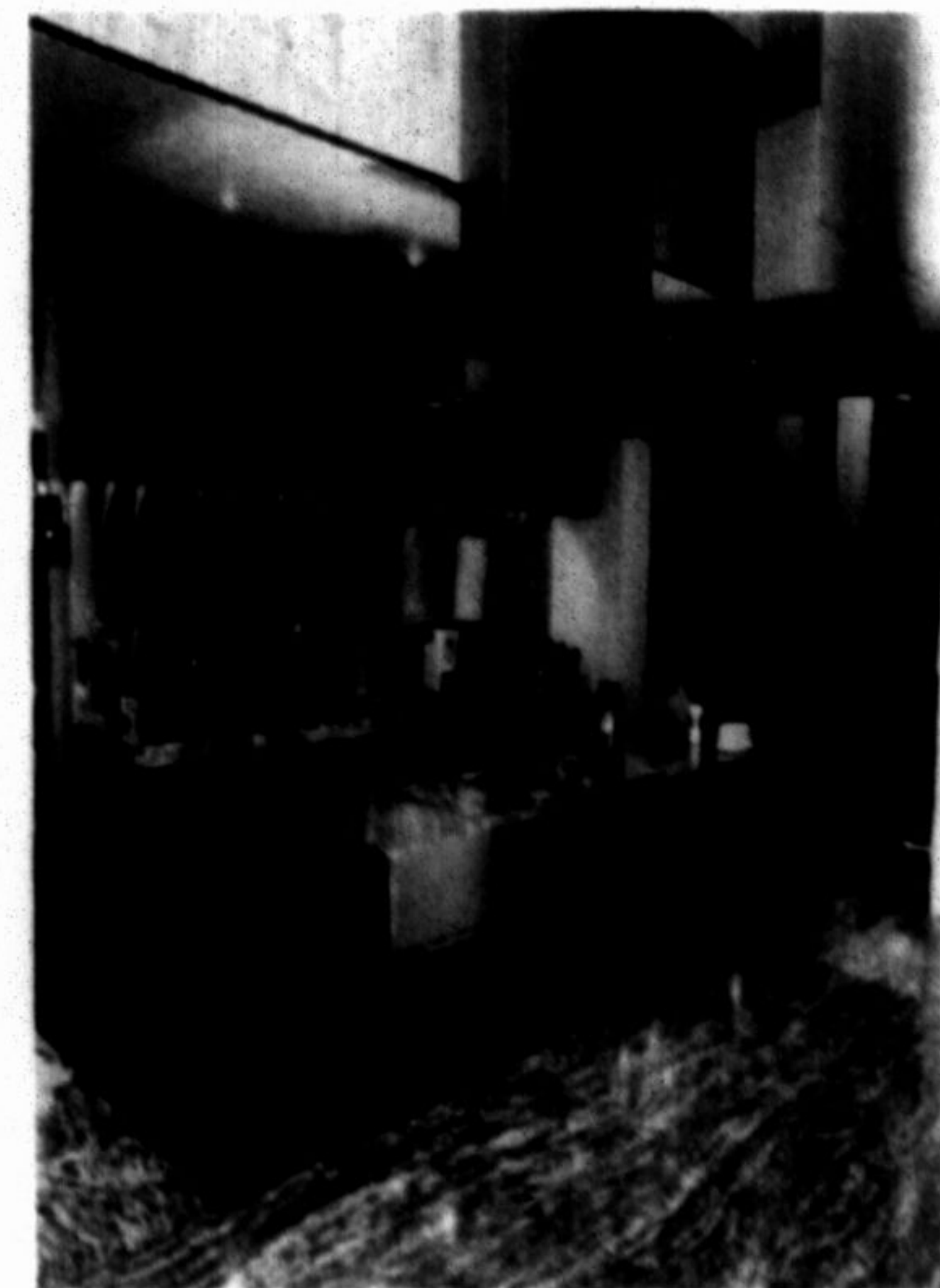
To renovate a room as important as the kitchen, hire a specialist. The job will be done quickly and you will be able to enjoy it for years to come.

Kitchen designers are constantly on the lookout for new items in the world of interior design and can suggest ergonomic innovations that will turn the most reluctant of cooks into enthusiasts!