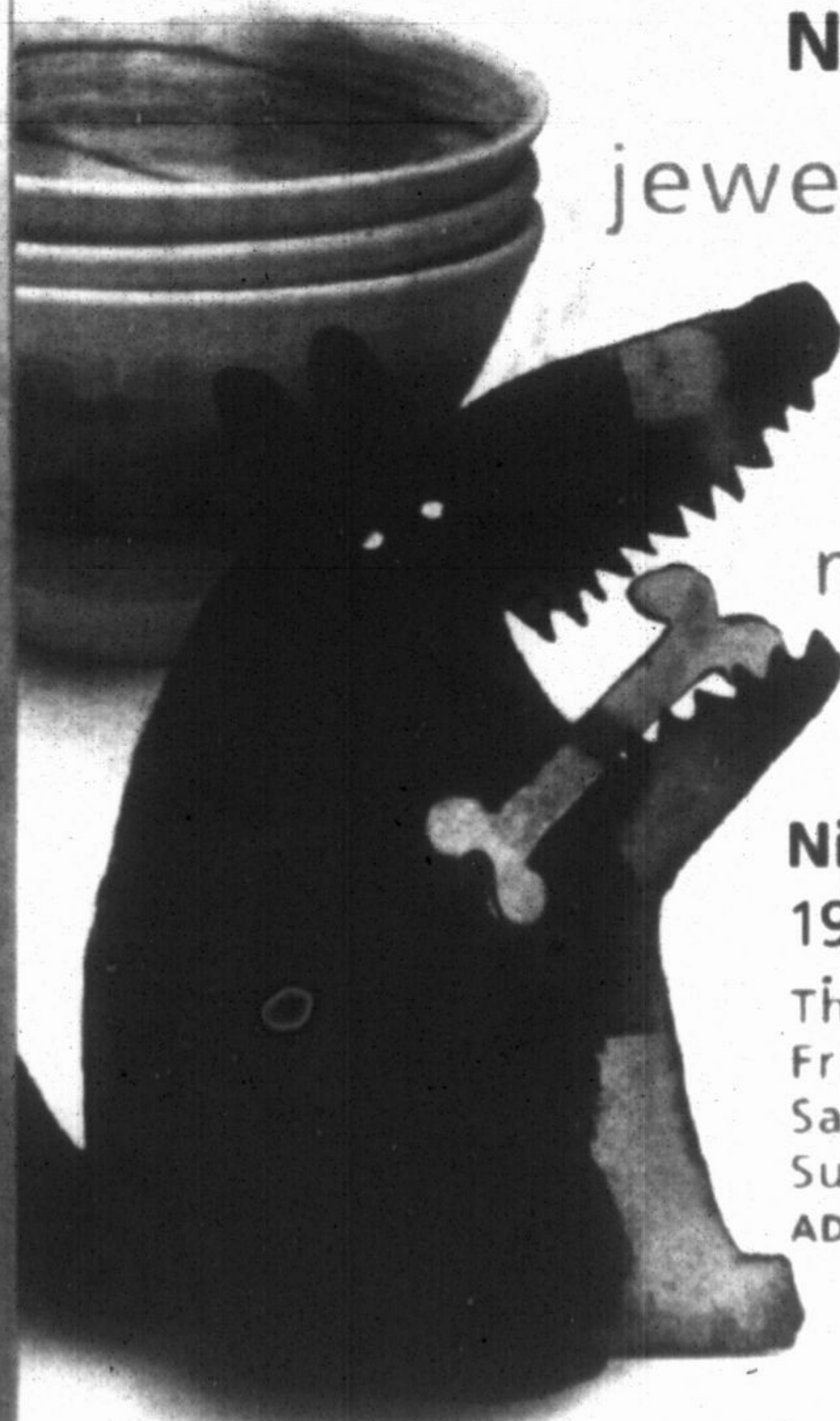
Dog Bite Steel

A Latcham Gallery Event www.latchamgallery.ca