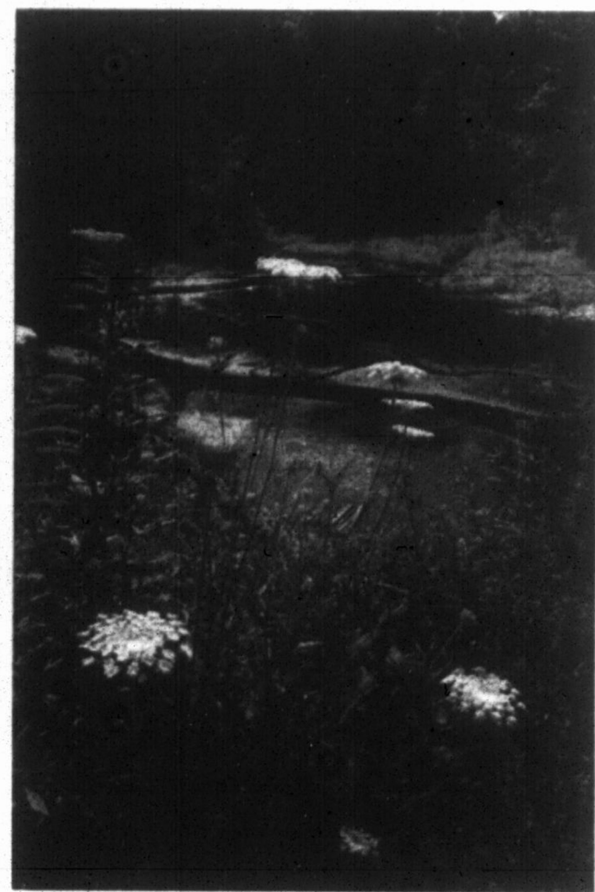
A pond along the popular Hollidge Tract trail. For additional photographs, go to yorkregion.com and look under the Multimedia heading.