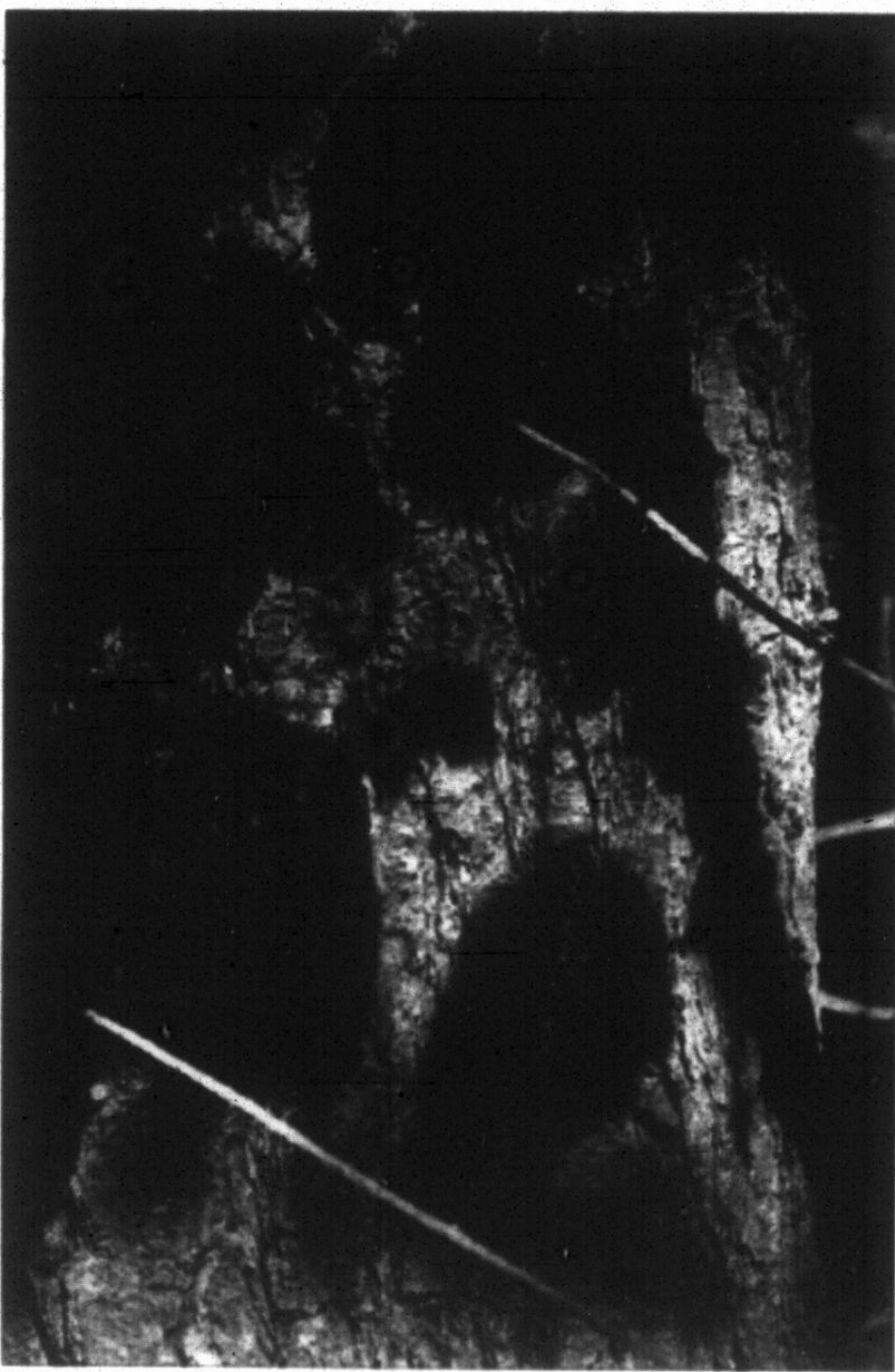
Leaves cast their shadow on the trunk of a red pine.