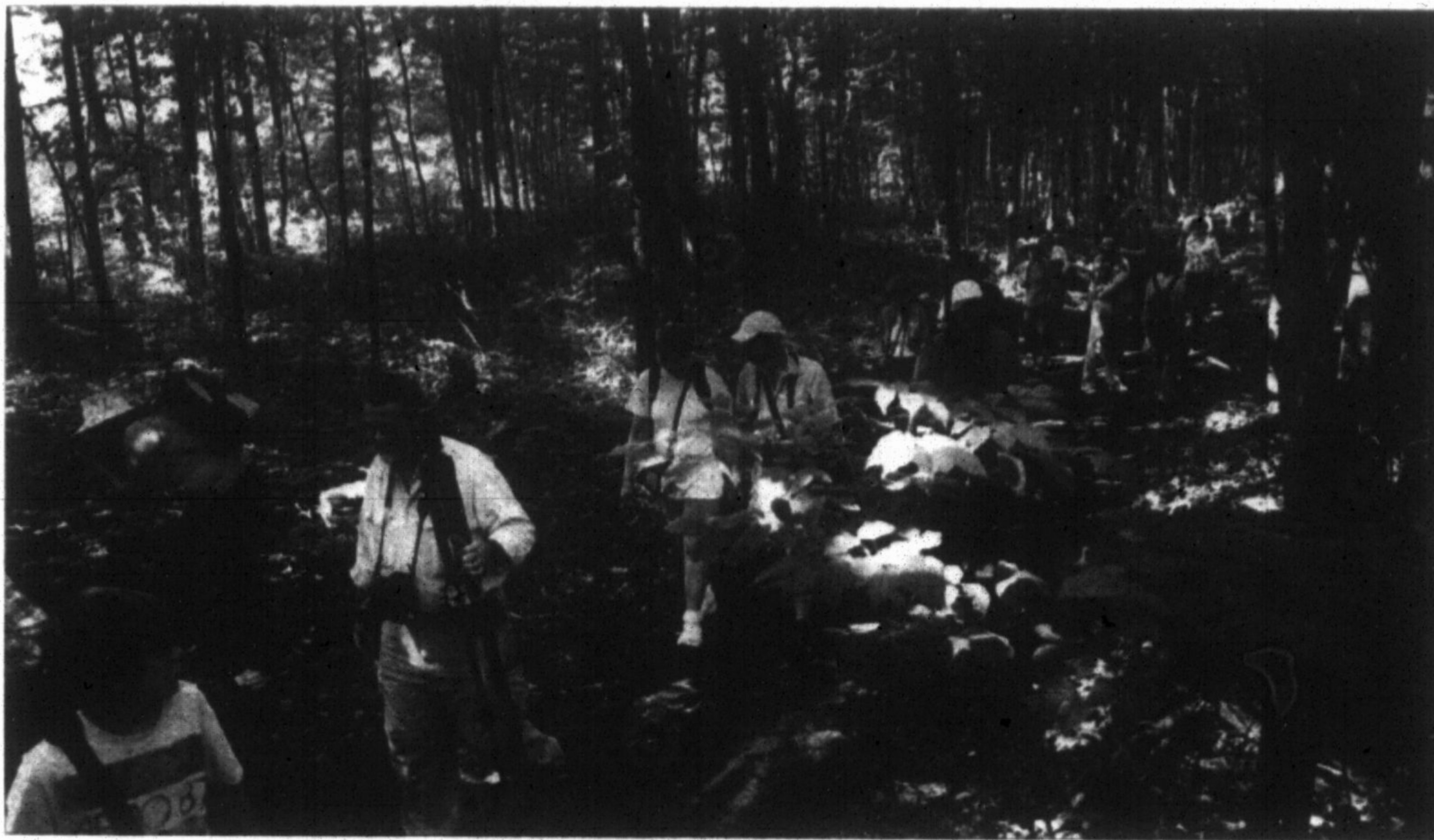
Photographers take a guided tour during a forest walk in the York Regional Forest Hollidge Tract on Hwy. 48 Saturday.