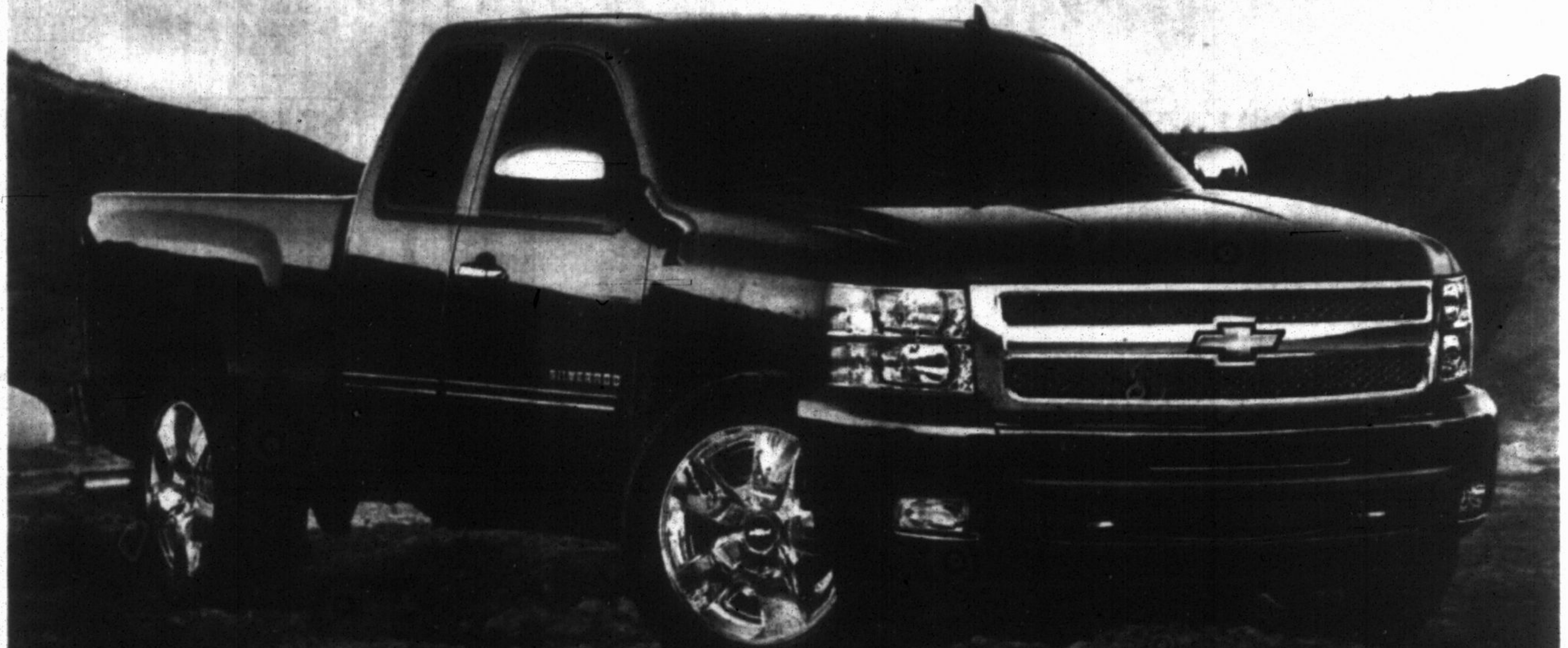
Ext. Cab LTZ with 20" Chrome-Tan Aluminum Wheels & Chrome Appearance Package