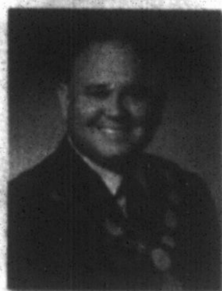
Mayor Frank Scarpitti