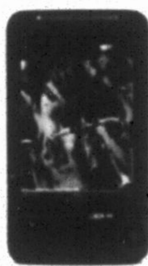
HTC Desire™ HD