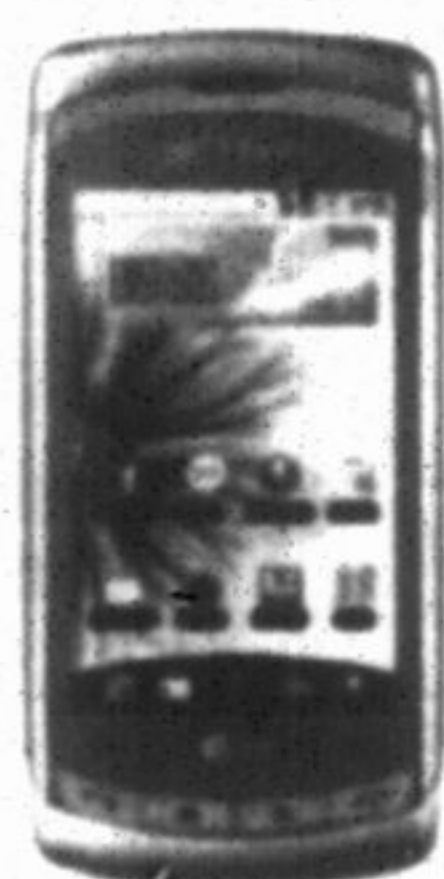
LG Shine Plus™