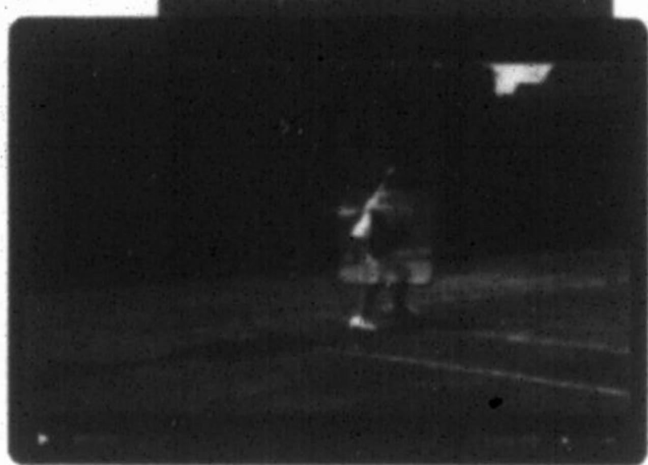
Timberlane Athletic Club offers Tennis training for all ages and levels.

Tuesday - Lifestyle & Leisure (Book Review)