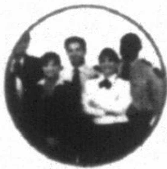
Hospitalityfirst.ca benefits York businesses.