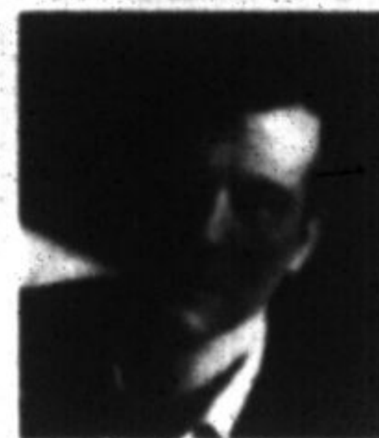
Dr. Richard Florida, renowned author of The Rise of The Creative Class