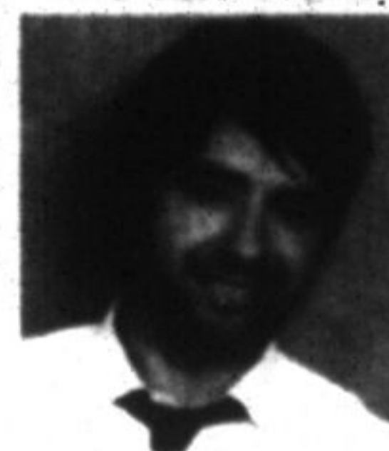
Jian Ghomeshi, celebrated CBC Radio Host of Q