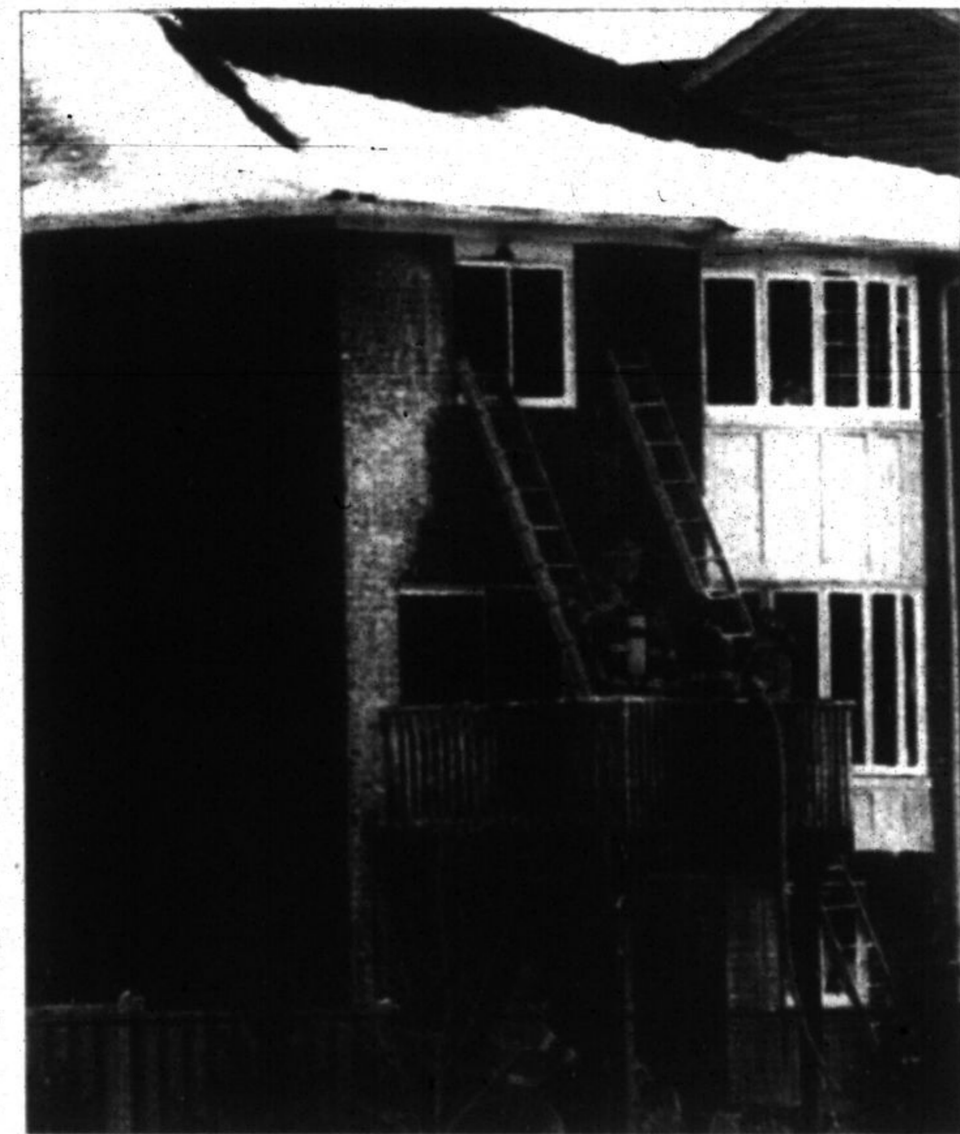
Firefighters work the back of the house, visible from Hoover Park Drive in south-end Stouffville.