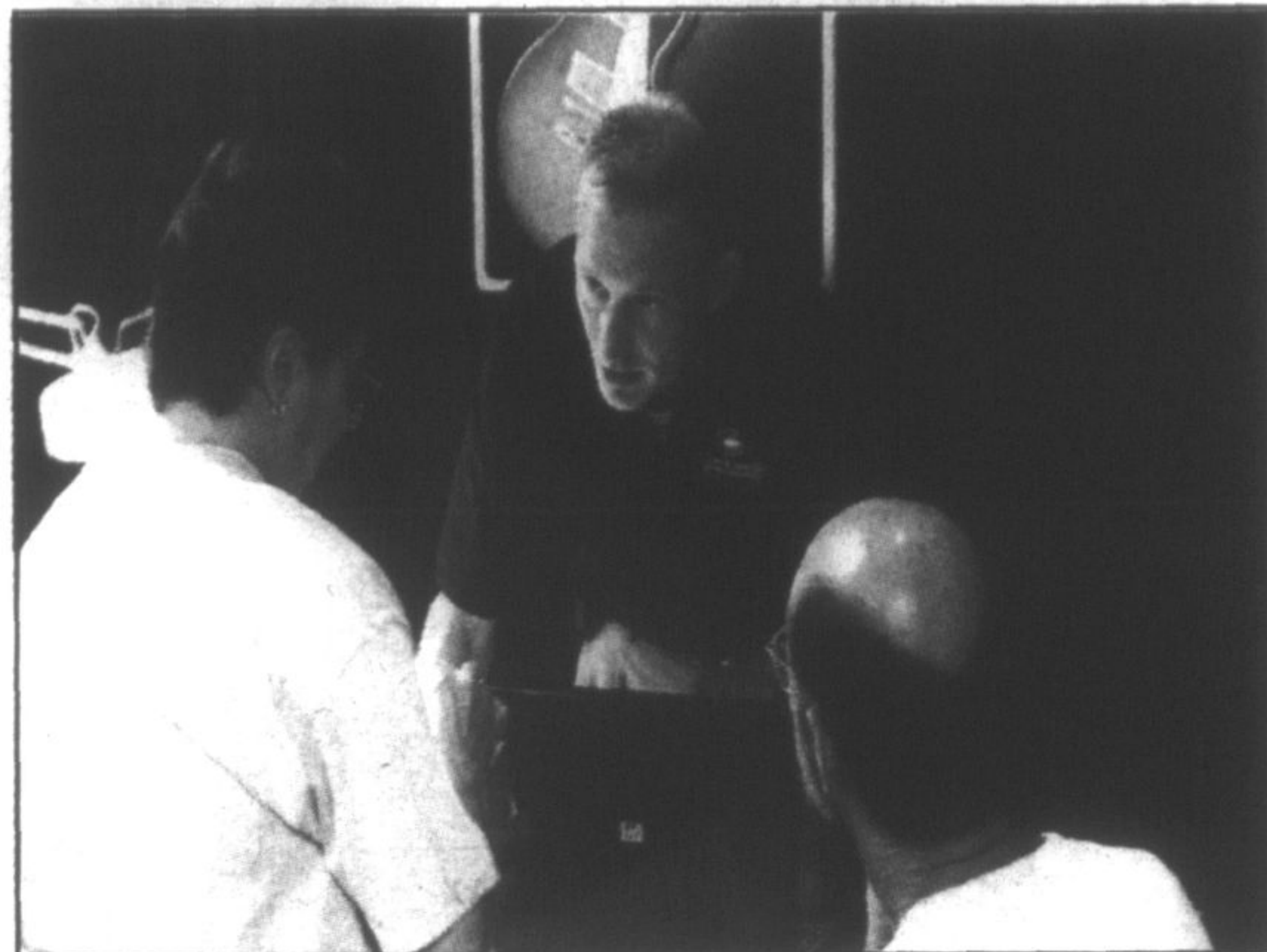
Above • A couple waits with anticipation while Roadshow expert examines their antiques and gold items. The Roadshow is at the Holiday Inn Hotel & Suites this week.

One visitor I spoke with yesterday said "It's unbelievable, I brought in some old coins that had been in a little cigar box for years and some old herringbone necklaces and in less than fifteen minutes I left with a check for $712.37. That stuff has been in my jewelry box and dresser for at least 20 years." Another gentlemen brought an old Fender guitar his