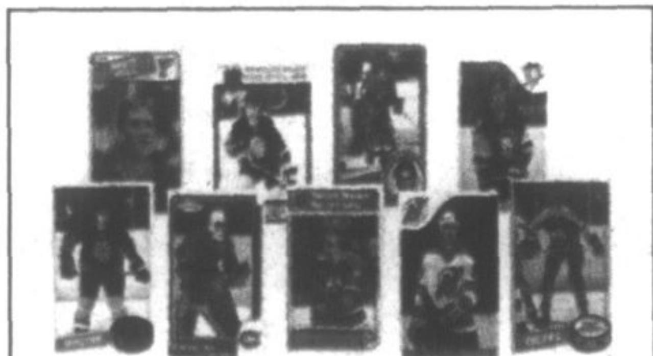
All sports memorabilia is in high demand including: Pre 1970's baseball cards; hockey cards, autographed baseballs, footballs & basketballs; jerseys; signed photos; etc...

• ADVERTISING ITEMS Metal and Porcelain signs, gas companies, beer and liquor makers, automobile, implements, etc.