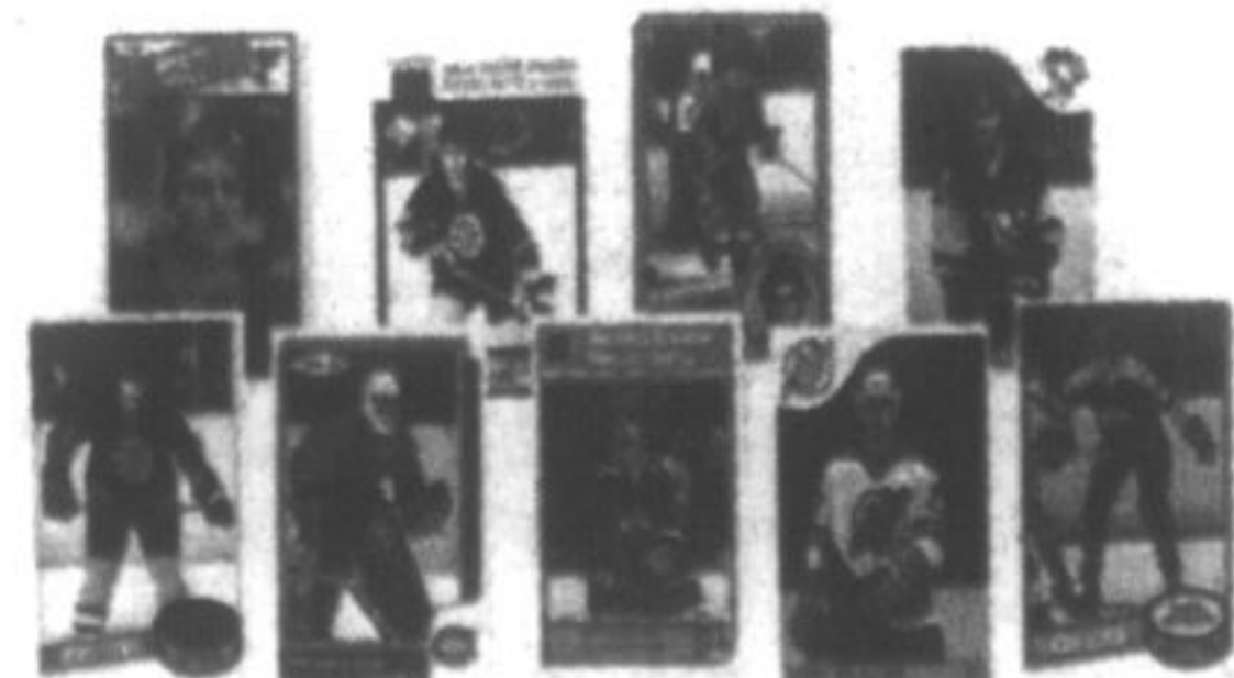
All sports memorabilia is in high demand including: Pre 1970's baseball cards; hockey cards, autographed baseballs, footballs & basketballs; jerseys; signed photos; etc...

• ADVERTISING ITEMS Metal and Porcelain signs, gas companies, beer and liquor makers, automobile, implements, etc.