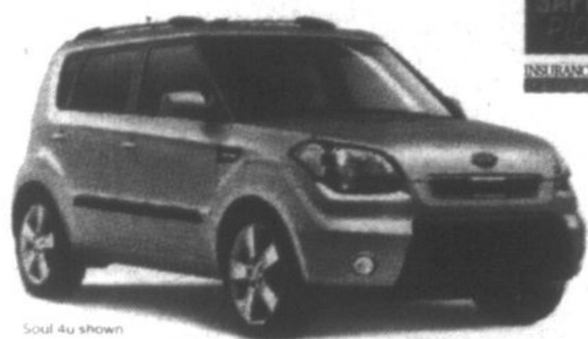
Soul As Shown

PAY UNTIL 2011* + 0% FINANCING FOR UP TO 84 MONTHS On Select 2010 and 2011 Models**