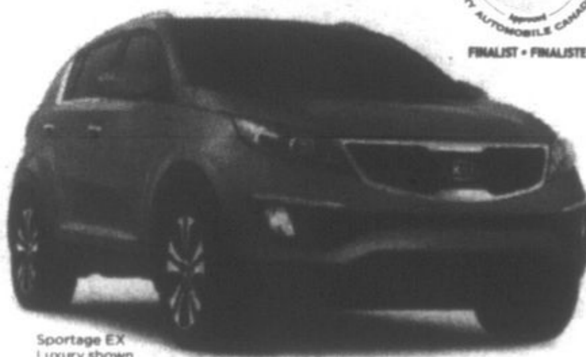
Sportage EX Luxury shown

HWY: 7.4L/100KM (38 MPG) HEATED ELECTRONIC CITY: 10.6L/100KM (27 MPG) FRONT SEATS STABILITY CONTROL