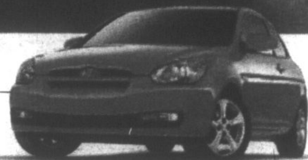
GL Sport model shown

2011 ELANTRA TOURING EUROPEAN INSPIRED 5-DOOR