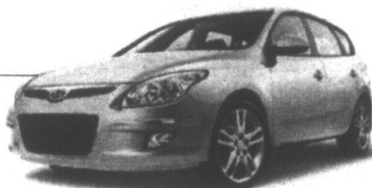
GLS Sport model shown