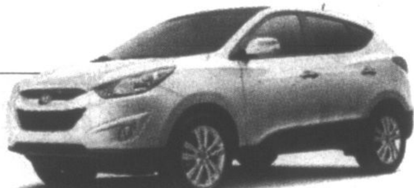
Limited model shown