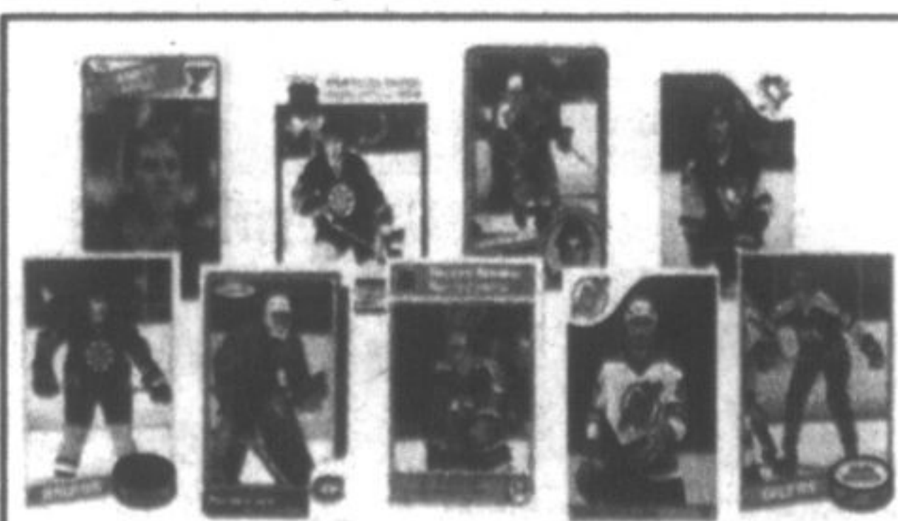
All sports memorabilia is in high demand including: Pre 1970's baseball cards; hockey cards, autographed baseballs, footballs & basketballs; jerseys; signed photos; etc...

Metal and Porcelain signs, gas companies, beer and liquor makers, automobile, implements, etc.