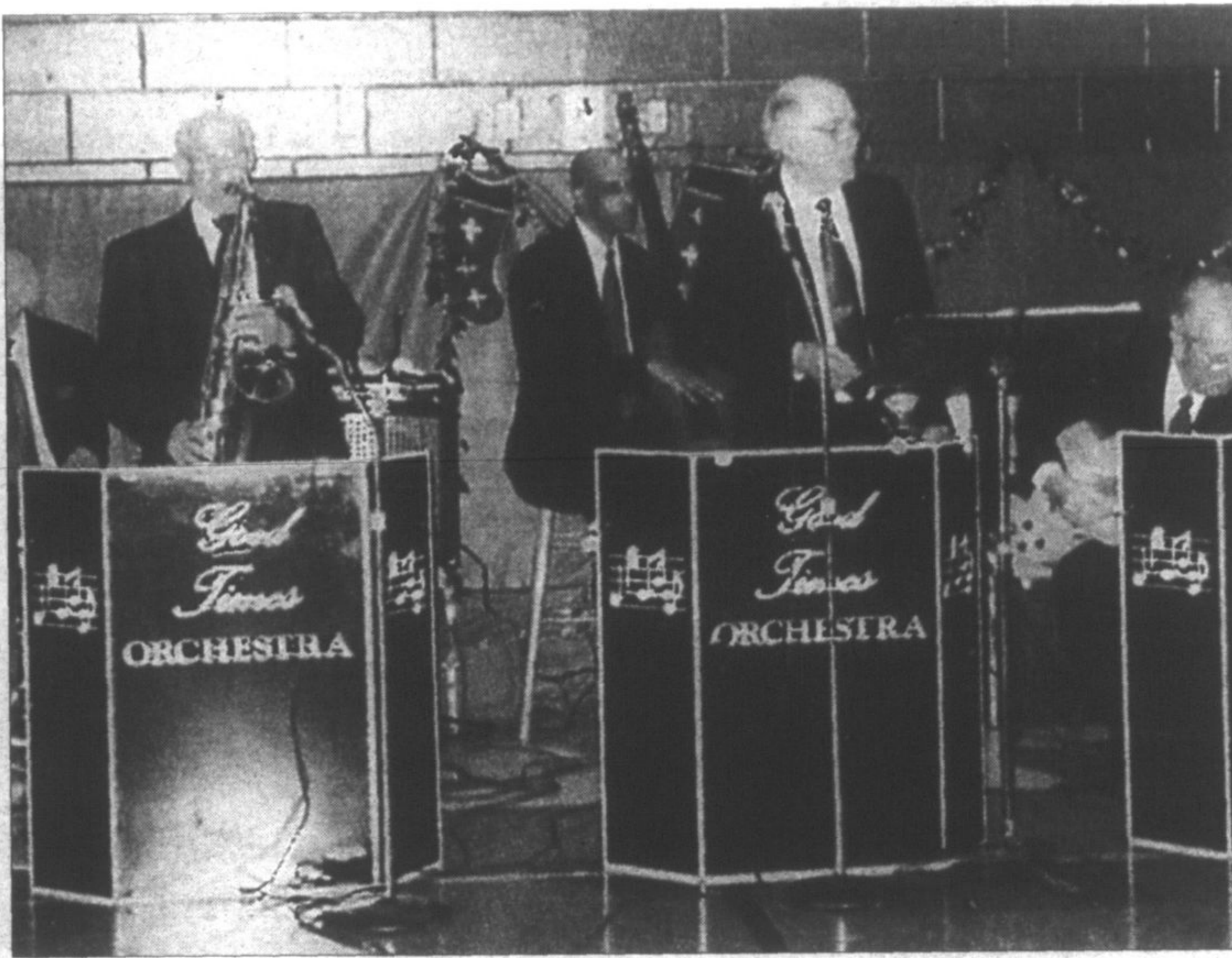
The Good Times Orchestra has become almost the house band at the Cedar Beach Pavilion on Musselman's Lake. They play their fourth show of the year Saturday night.

'We're not a rock band. We're all grey-haired.'