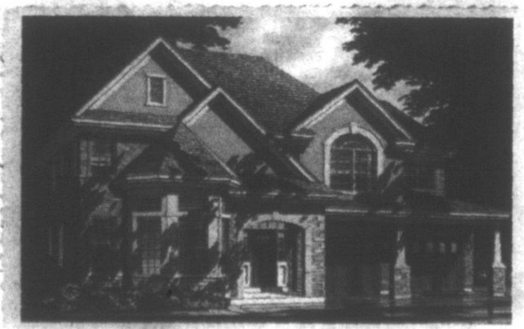
50' WideLot™, The Winfield 'C', 3,426 Sq.Ft., $575,990