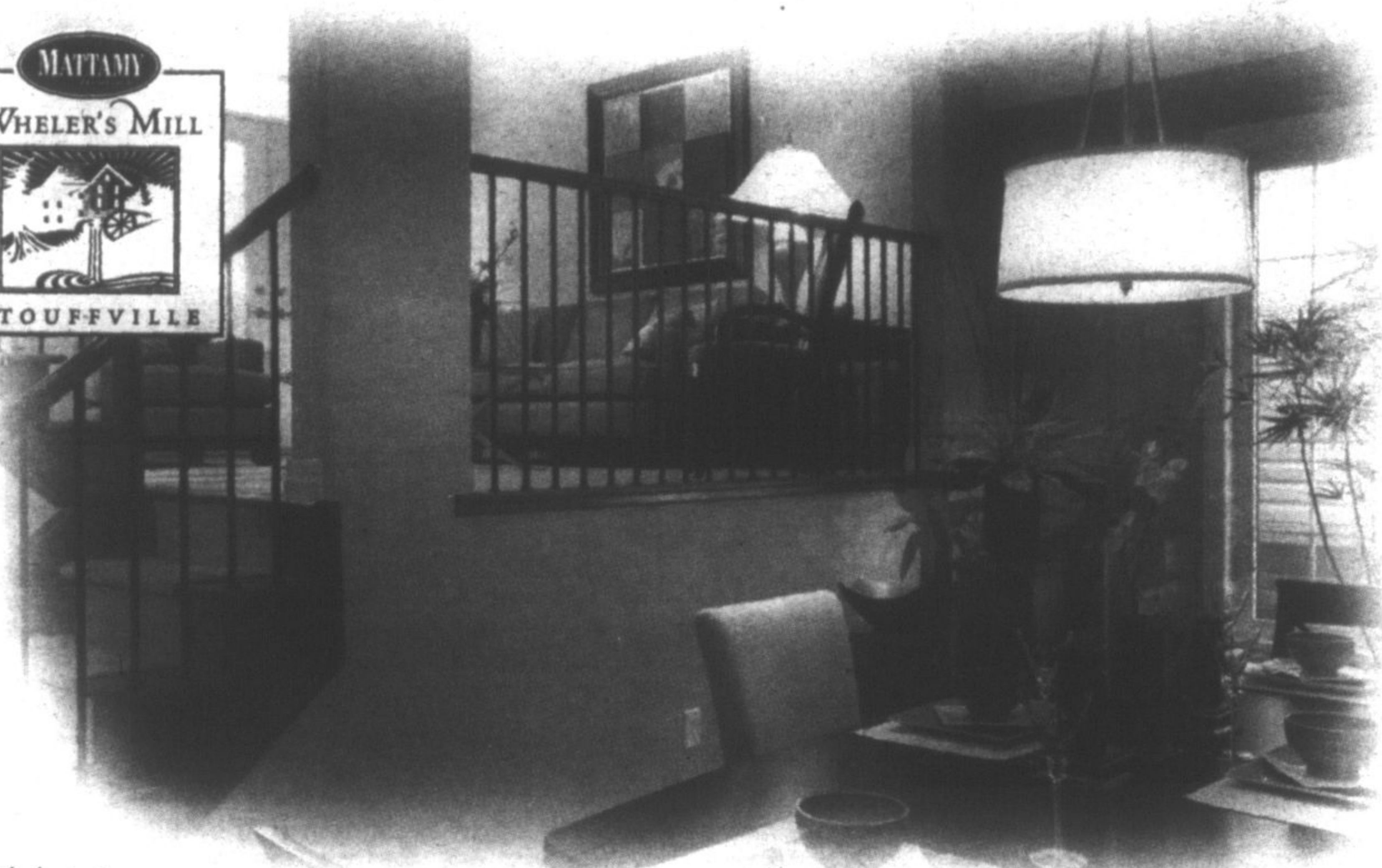
Model Home Interior In Wheler's Community

We are proud to announce that both our established Wheler's communities are wide open. You will find our elegant 45' and 50' WideLot™ homes in Wheler's Mill as well our very final release of 36' detached WideLot™ homes in Wheler's on Main. Once these homes are gone, our Wheler's communities will be complete.