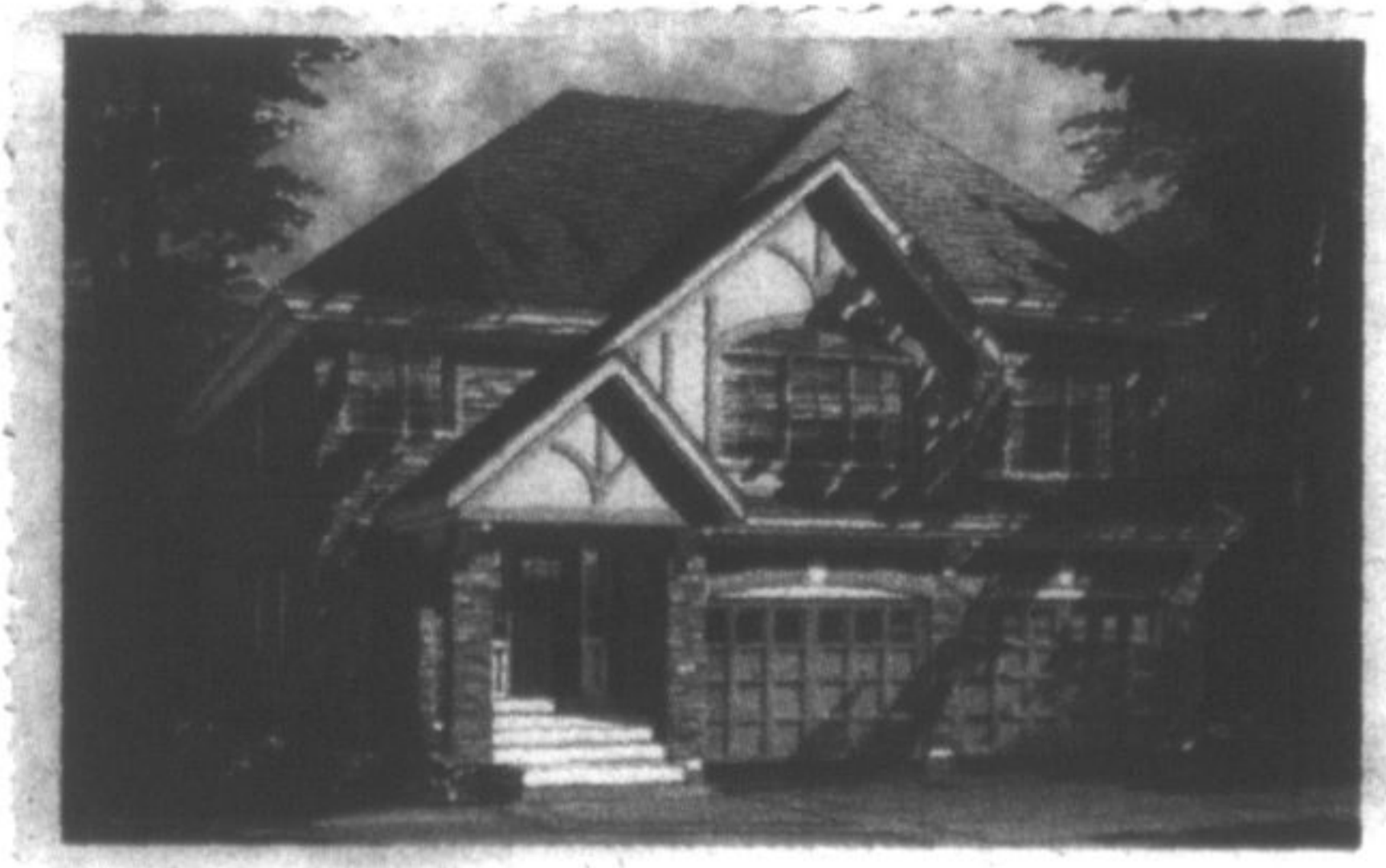
36' WideLot™, The Laketon 'C', 1,945 Sq.Ft., $416,990