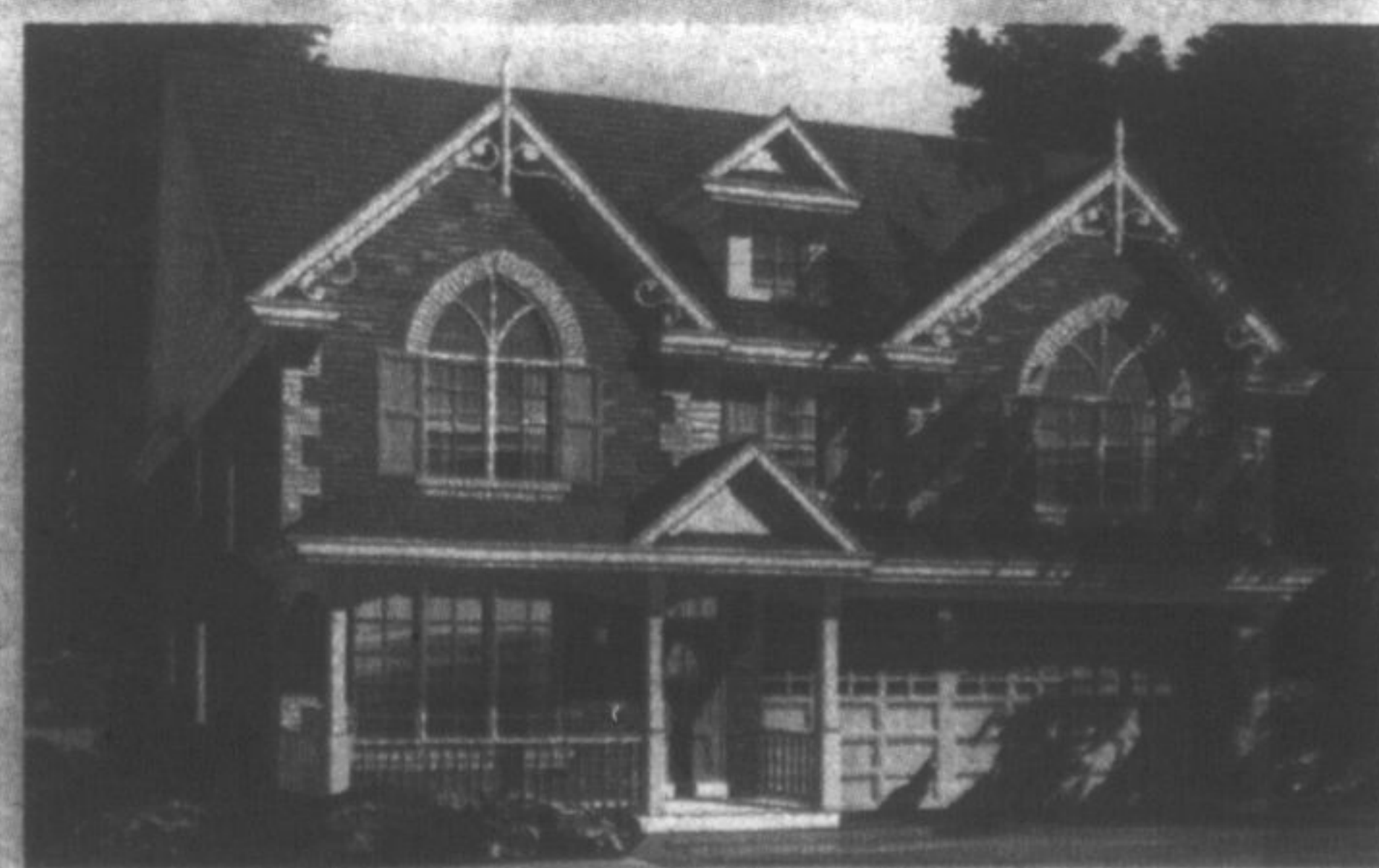
40' WideLot™, The Edenberry 'B', 2,610 Sq.Ft., $471,990