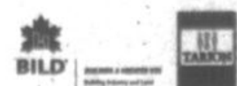
BILD 2009 Home Builder Of The Year.

Presentation Centre Hours: Monday to Thursday 1pm-8pm; Friday 1pm-6pm; Saturday, Sunday and Holidays 11am-6pm