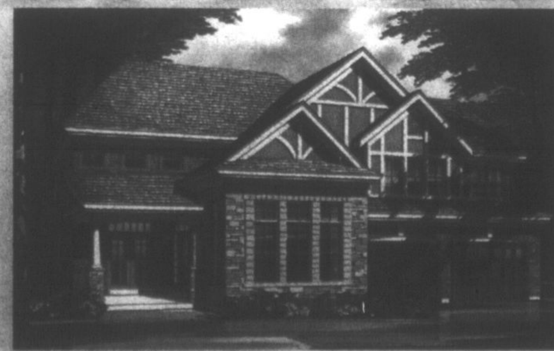
50' WideLot™, The Leawood 'C', 3,386 Sq.Ft., $574,990