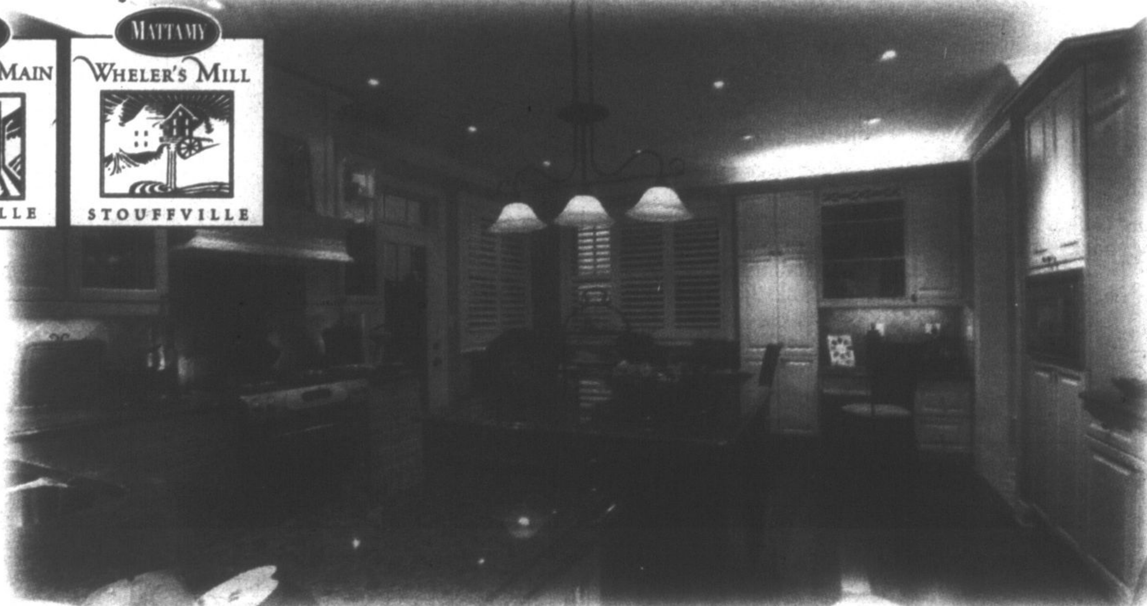
Wheeler's 45' Model Home Kitchen

Today we are proud to announce that both our established Wheeler's communities are wide open. You will find our elegant 45' and 50' WideLot™ homes in Wheeler's Mill as well our very final release of WideLot™ Townhomes, as well as 30', 36' and 40' detached homes in Wheeler's on Main. Once these homes are gone, our Wheeler's communities will be complete.