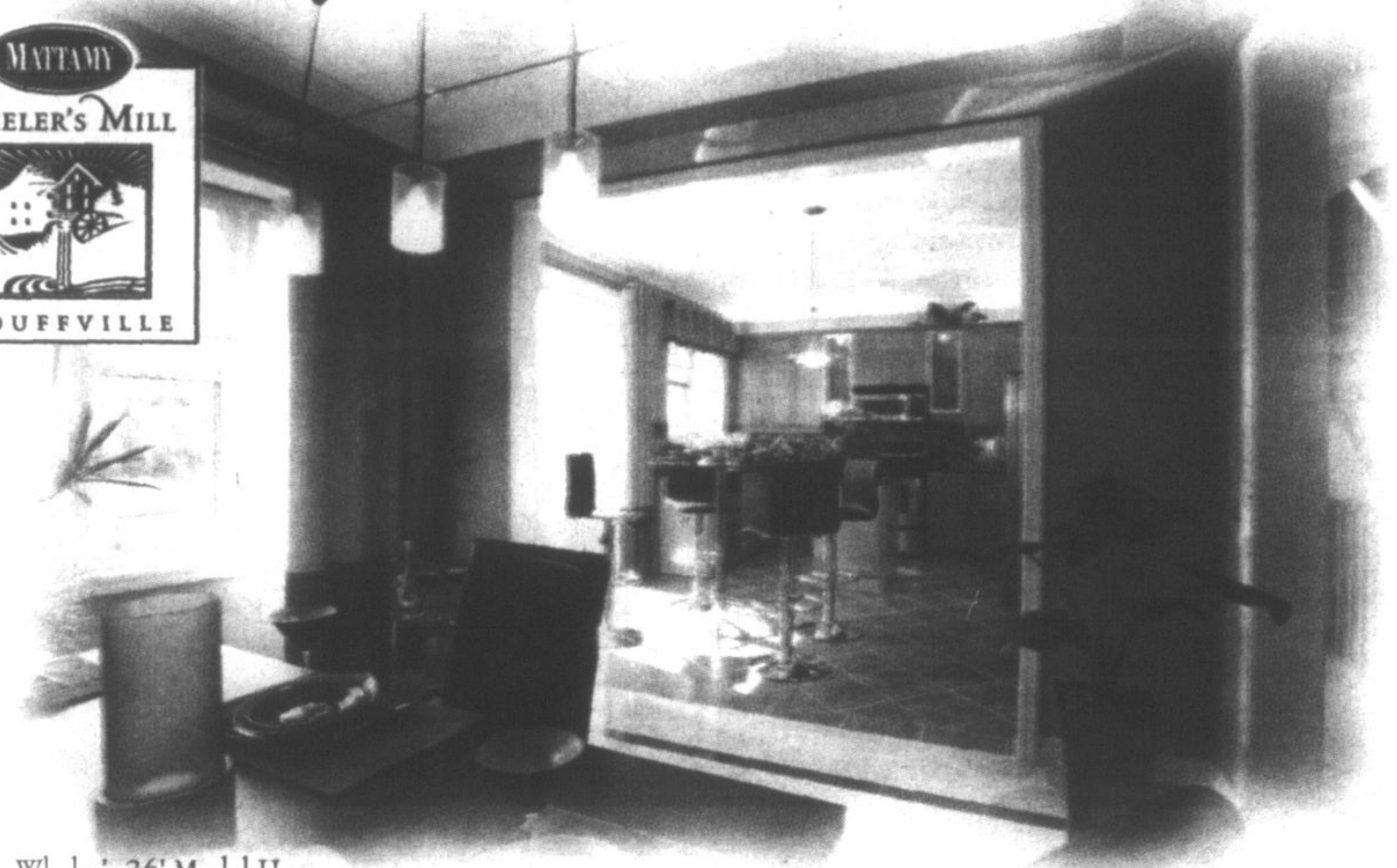
Wheeler's 36' Model Home

Today we are proud to announce that both our established Wheeler's communities are wide open. You will find our elegant 45' and 50' WideLot™ homes in Wheeler's Mill as well our very final release of WideLot™ Townhomes, as well as 30', 36' and 40' detached homes in Wheeler's on Main. Once these homes are gone, our Wheeler's communities will be complete.