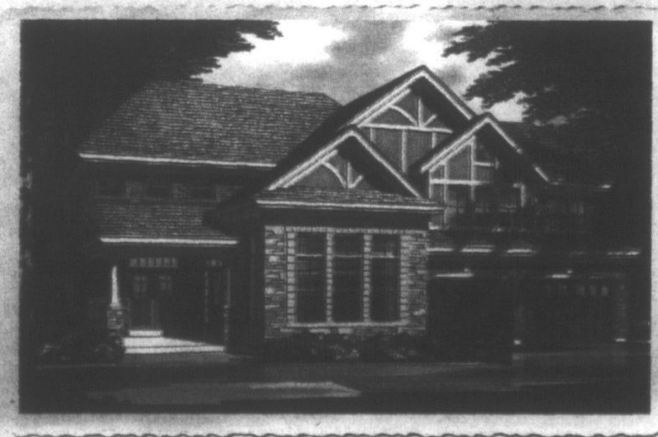
50' WideLot™, The Leawood 'C', 3,386 Sq.Ft., $574,990